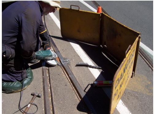
Alan Snowball hard at work on 25 November