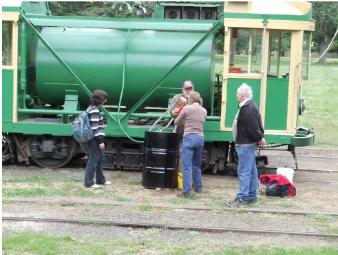
Organised by Eureka Orienteers, students from St Patricks College attempt to pump water into No 8. 29 November