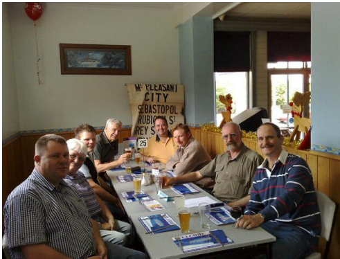
The Board at lunch after the December meeting. 7 December