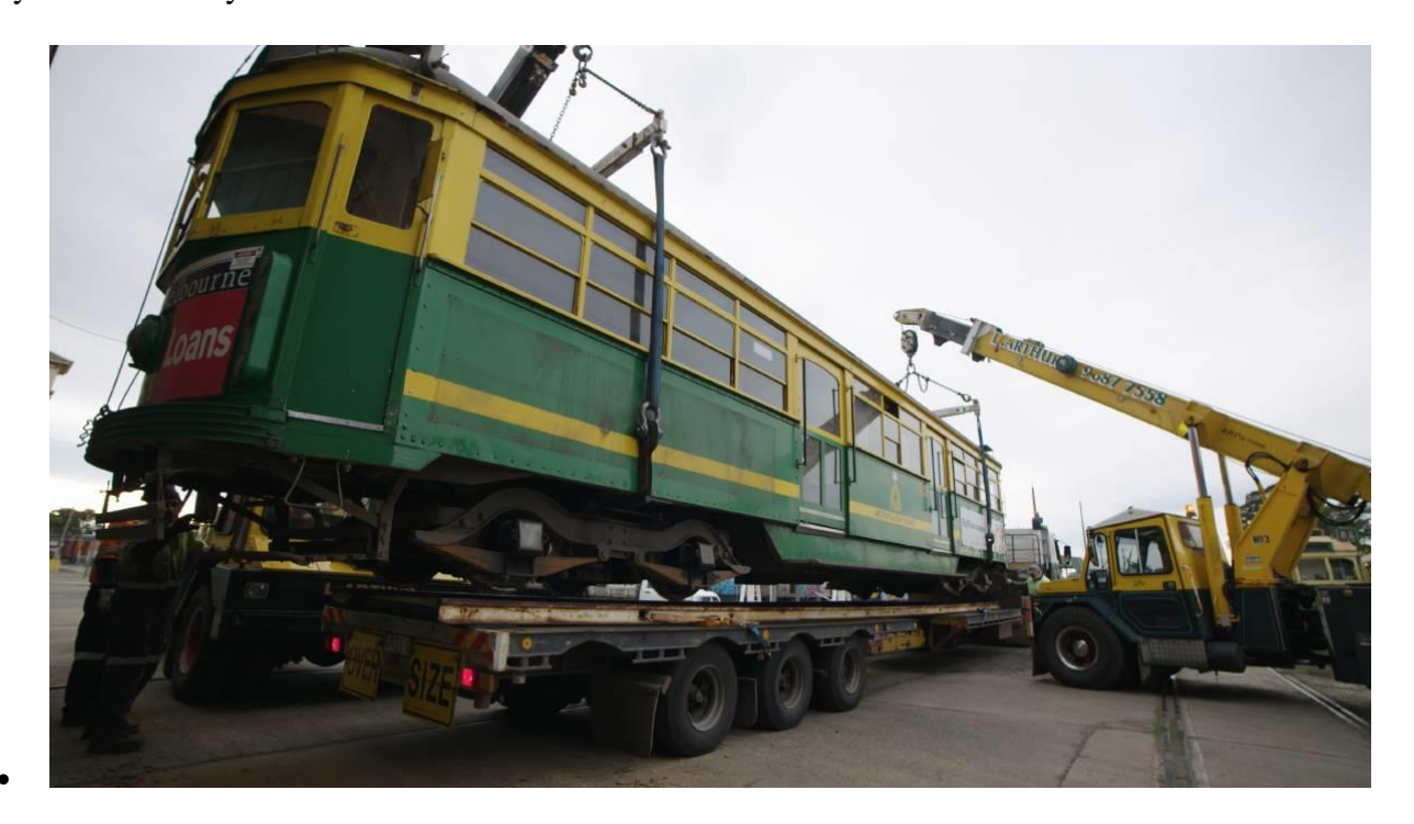
One of the trams leaving the Newport Workshops

"They will take 3-5 years to restore which will be done off site."