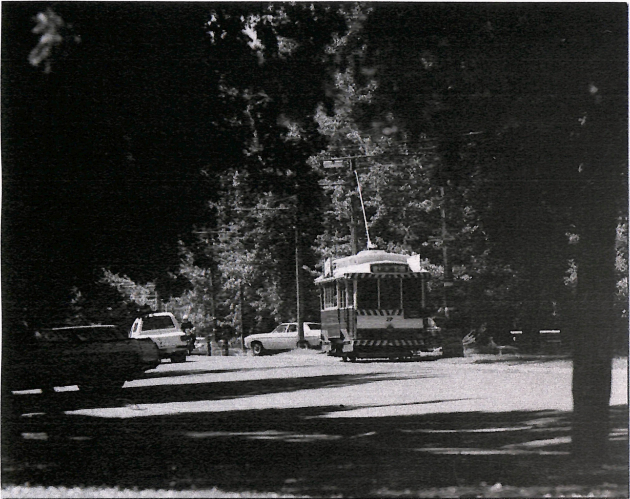
27 rumbles up Wendouree Prd in the Ballarat Botanical gardens on its way to Carlton St