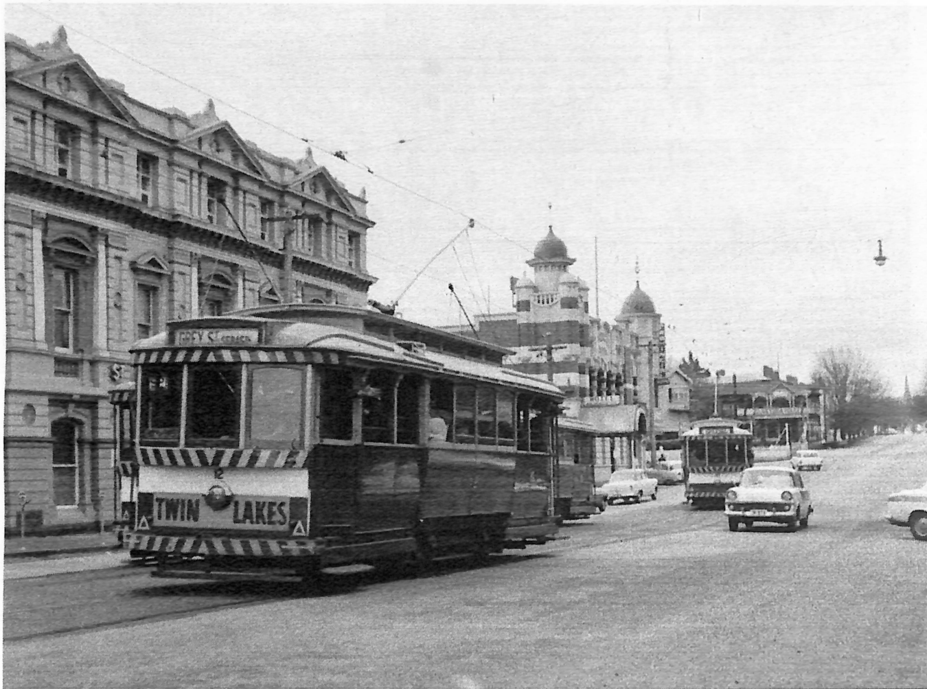
Single trucker No. 12 has just crossed over the level crossing in Lydiard St and will continue to Grey St while No. 21 follows up behind .