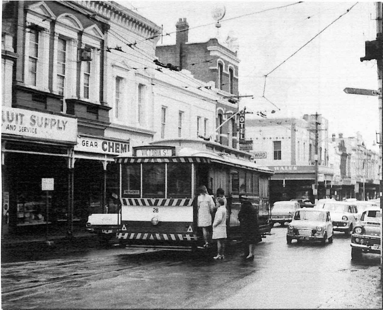
A typical Ballarat day as No. 28 picks up passengers in Bridge St , now a Mall.