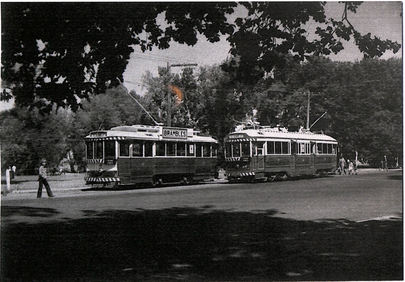
Single trucker No. 27 crosses bogie car No. 38 at Gardens Loop .