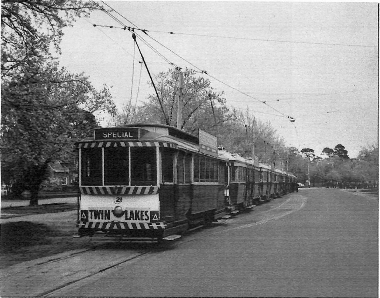
Several tram tours were run before the system closed , this one in 1967 when traffic on the Ballarat highway was a lot quieter .