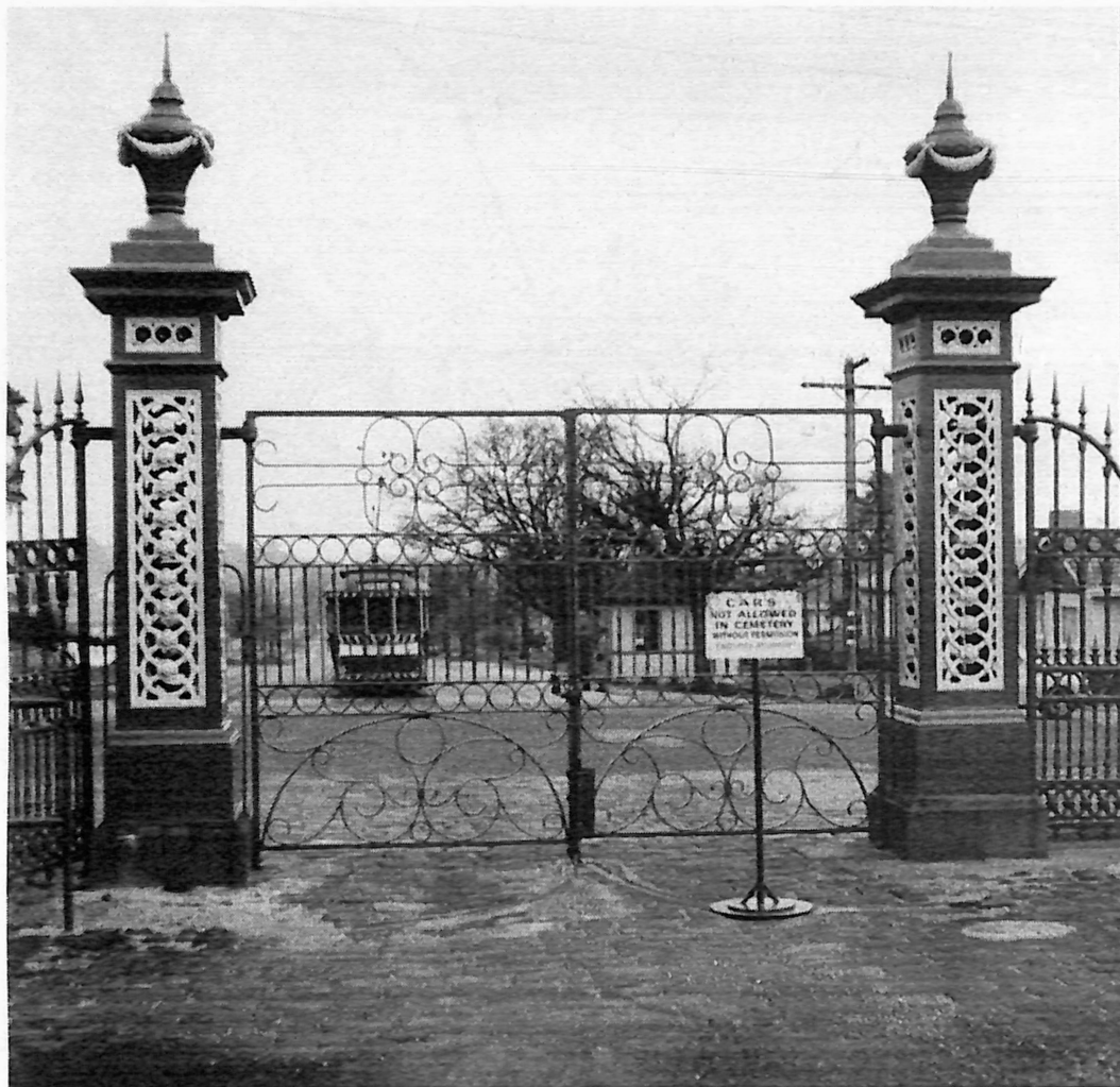
Single trucker No. 33 at the cemetery gates terminus of Lydiard St North .