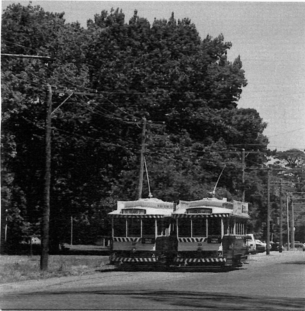
Now to 1983 and museum cars 27 and 33 cross at Gardens loop .