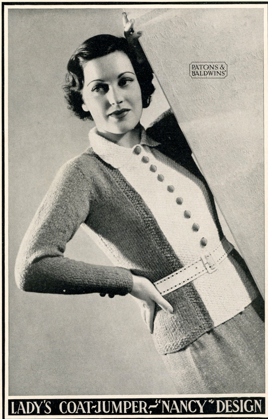
LADY'S COAT-JUMPER, "NANCY" DESIGN

THE EMBROIDERY. —Work a border, as given in the chart, round each sleeve above the cuff, and above the ribbing of the back and each front, and along the bottom of each section of the Collar.