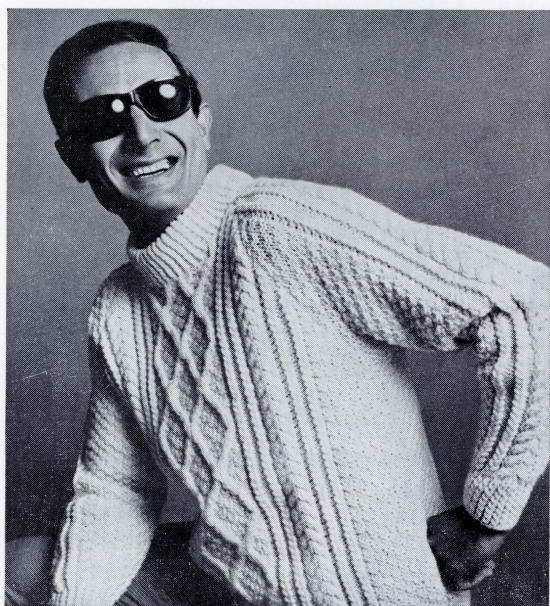
BACK COVER —The all-over Aran jumper has raglan sleeves and a round doubled neckline.

MAKE UP —With a slightly damp cloth and warm iron, press lightly. Using a fine back-stitch seam, sew up side and sleeve seams. Fold neckband in half on to wrong side and slip-stitch in position. Finally, press all seams.