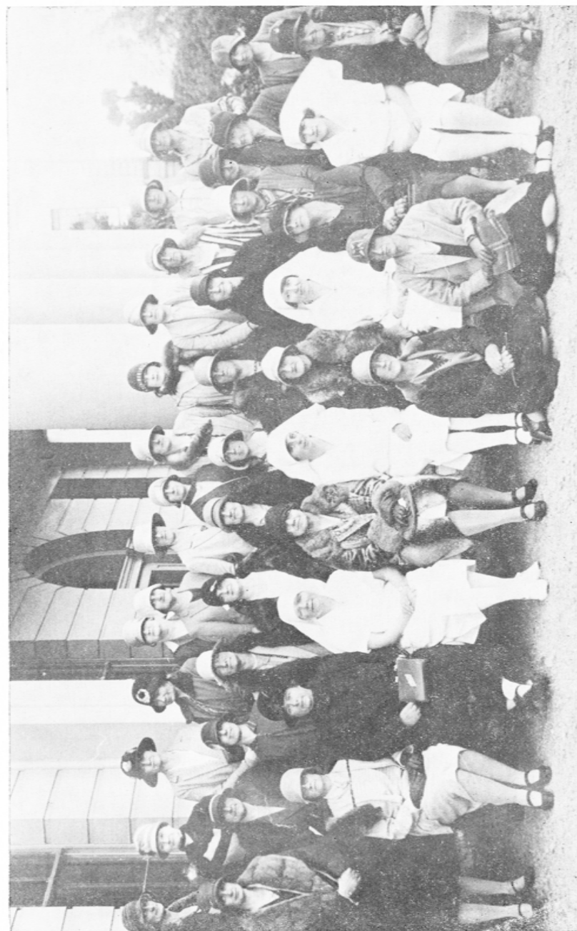
FIRST REUNION, 11th OCTOBER, 1929. (Taken in front of Alfred Wing, Drummond Street).