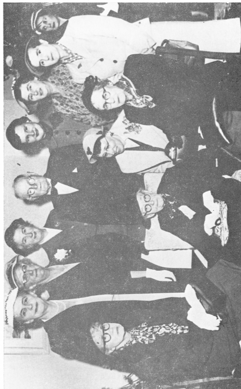
20th REUNION — 1956. HOSPITAL CENTENARY YEAR.

A group photograph was taken of those present.