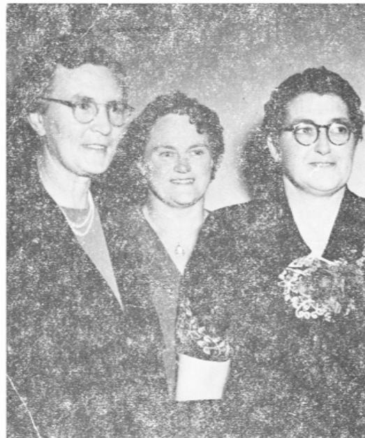
25th REUNION — 1953