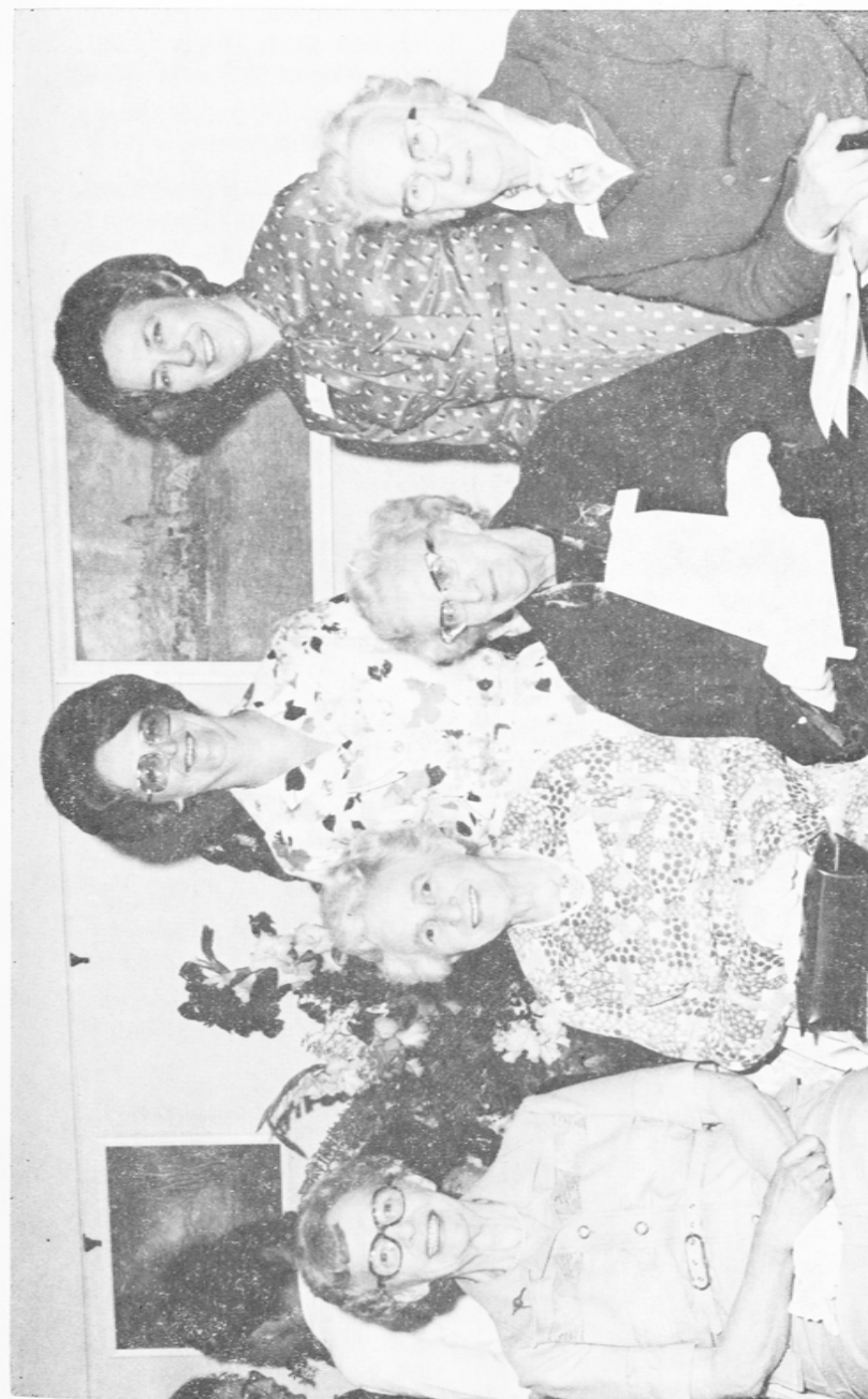
46th REUNION — 1974. PRESENTATION OF LIFE MEMBERSHIPS.