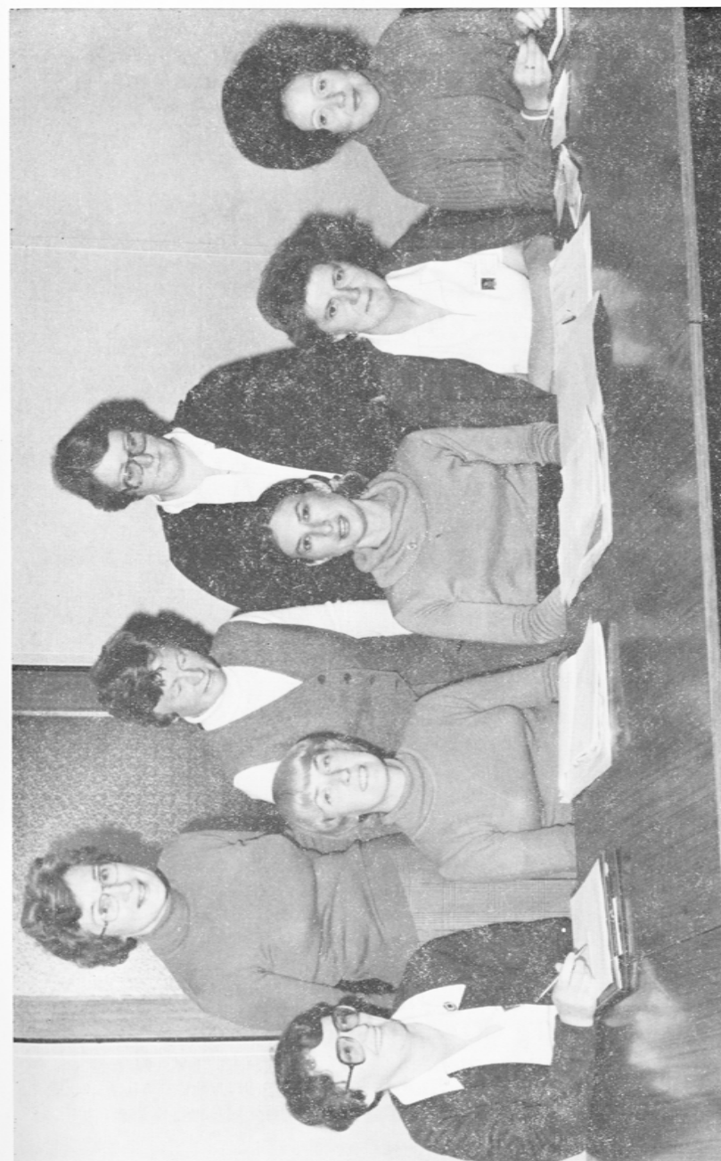
50th REUNION COMMITTEE