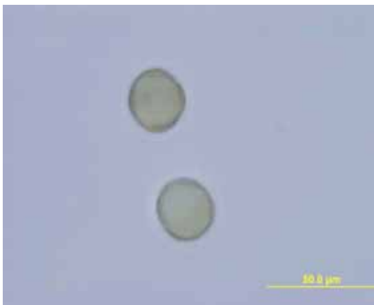
Figure 2: Canola pollen grain ex canola honey

The percentage of dry weight canola pollen in the 32 Australian canola honey samples ranged from 0.15% to 0.443% with a mean of 0.2\% \pm 0.12 . The two GM canola honey samples sourced from Canada contained 0.19% and 0.24% by weight.