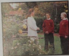
Home group teachers work closely with students and parents.

Williamstown High School has an excellent pastoral care system. It has led in this field for many years and has been emulated by other schools in Victoria.