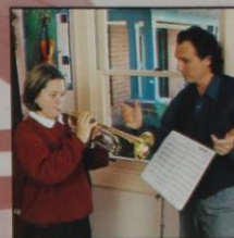
Tuition is offered in a range of instruments.

There are many opportunities for performance where students gain a sense of achievement and confidence. Many former students have successfully pursued tertiary studies and careers in music.