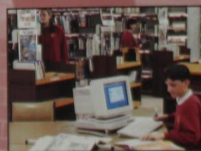
Information technology is integrated into many areas of the curriculum.

Centre comprises full class sets of both Apple Macintosh and IBM computers through which students can access the Internet. Students also have access to computers, printers, CD ROM and Internet facilities through the library and boutique sites around the school.