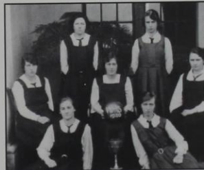
WHS Netball Team 1920

WILLIAMSTOWN HIGH SCHOOL IS ONE OF VICTORIA'S OLDEST AND MOST DISTINGUISHED HIGH SCHOOLS, HAVING SERVED THE AREA FOR OVER EIGHTY YEARS.