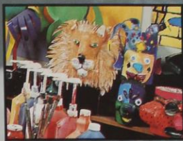
The diverse Art program celebrates student work through regular exhibitions