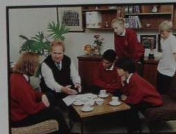
The Principal regularly consults with S.R.C. representatives