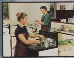
Food Technology facilities include a well equipped kitchen and dining room