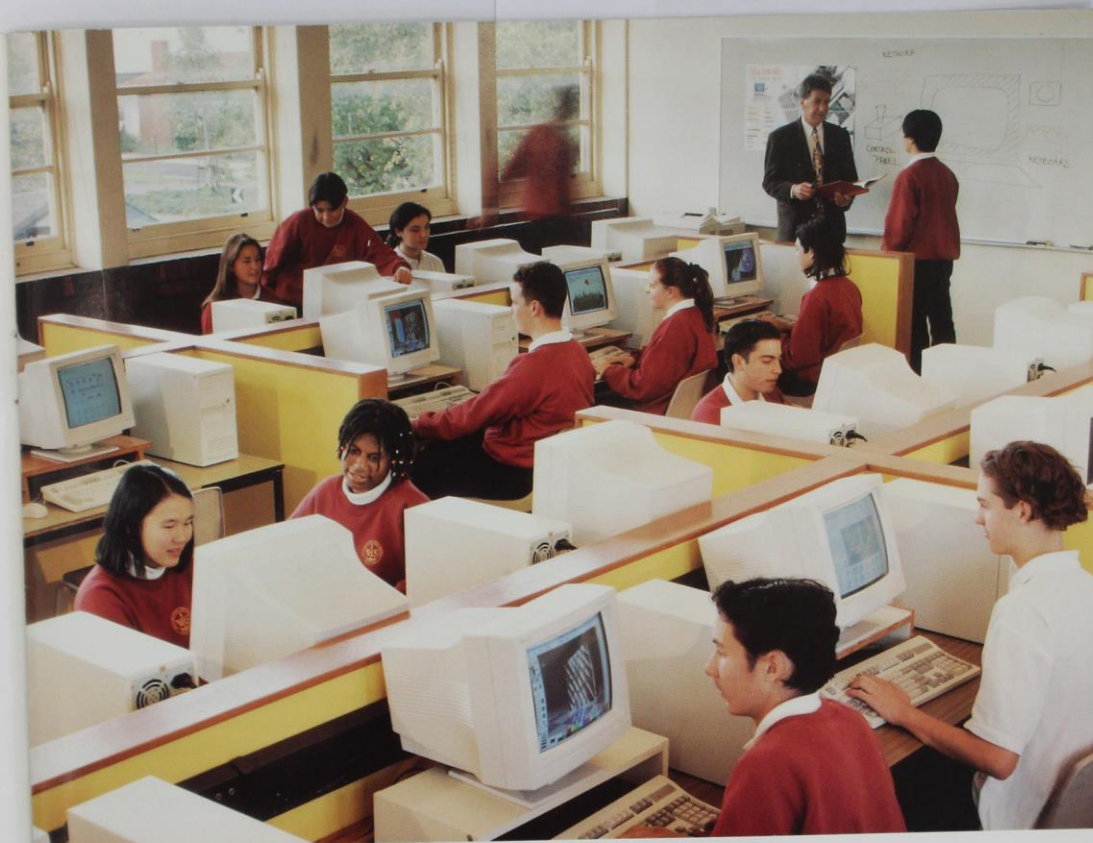
We are committed to providing students with access to modern information technology.