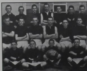
WHS Football Team 1920