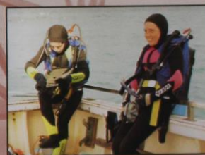
W.H.S. has a proud history of sporting involvement and success.

sports, students have the opportunity to participate in Lacrosse, Cross Country Running and Outdoor Activities including Skiing, Scuba Diving and Rockclimbing. Annual Swimming and Athletics Carnivals are held. The school participates in district, zone and state competitions which are open to all students.