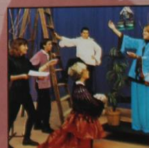
The multi purpose performance centre opened in 1994

productions and performances, debating, excursions, guest speakers and lunch time activities. The school conducts an extensive Camps Program which allows for at least one camp at each year level.