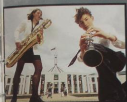
School Orchestras tour both nationally and internationally