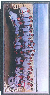
Senior Concert Band 1996