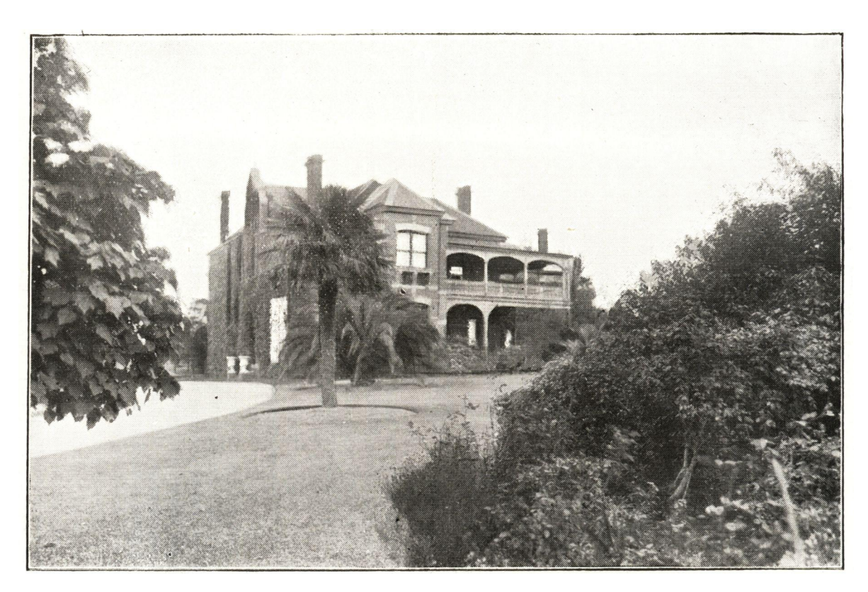
Carey Baptist Grammar School. Main Building.