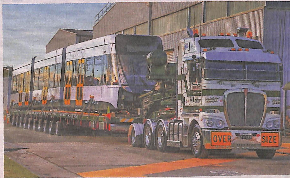
On the move: Melbourne's new tram leaves Bombardier's Dandenong South depot.