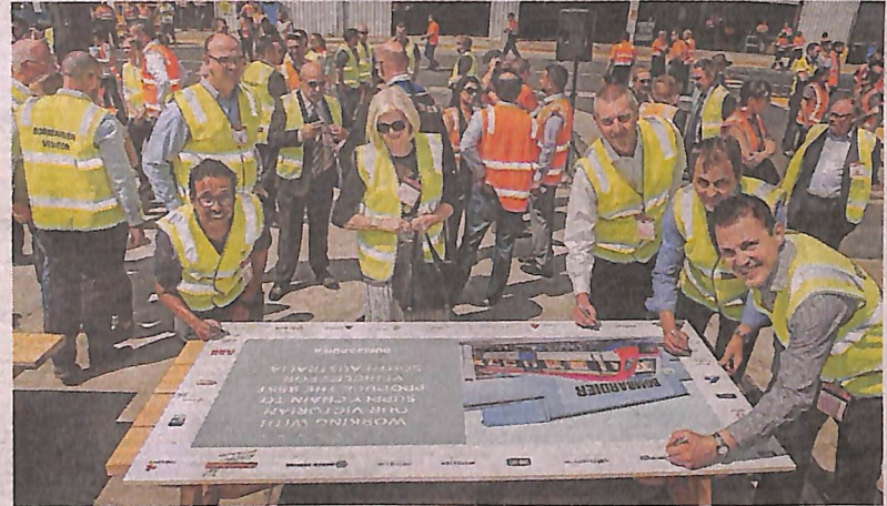
Workers and guests sign the project completion board. 145178

"But we have worked together through these challenges with the experience and dedication of the Bombardier workforce at Dandenong," he said.