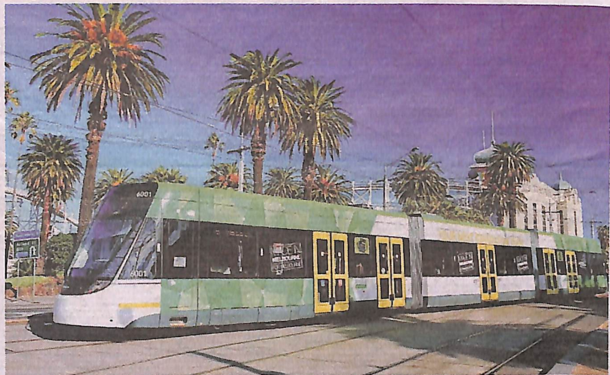
An E-Class tram in action.

"At Bombardier, we are very pleased to see our locally made tram contribute