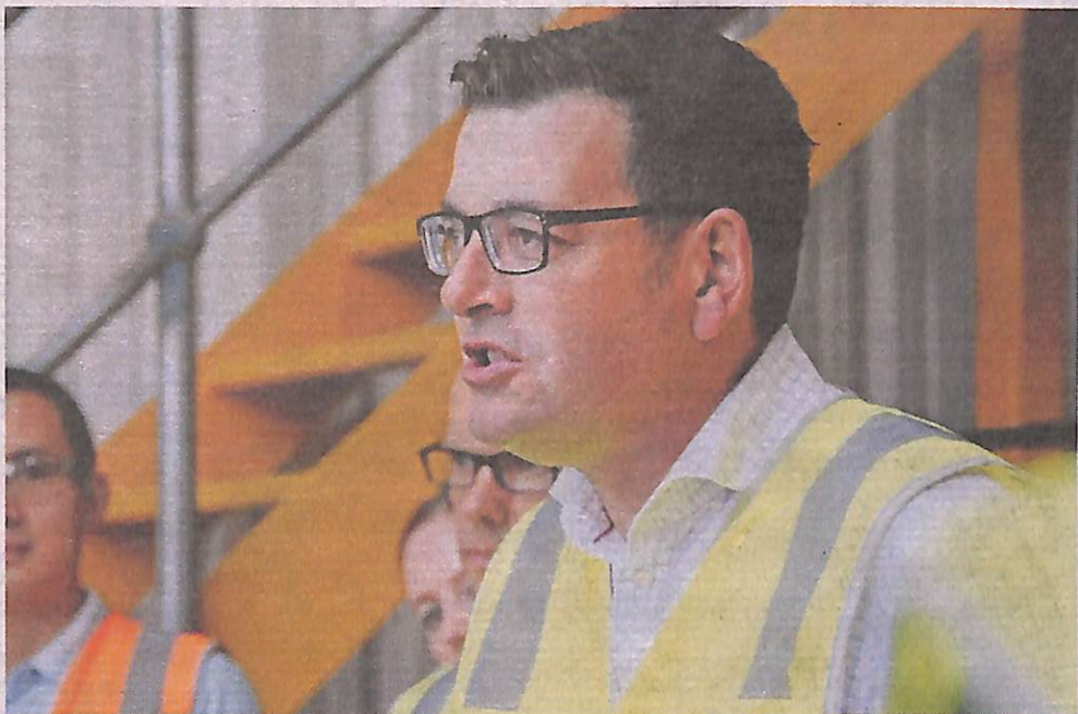
Premier Daniel Andrews speaks at Bombardier.