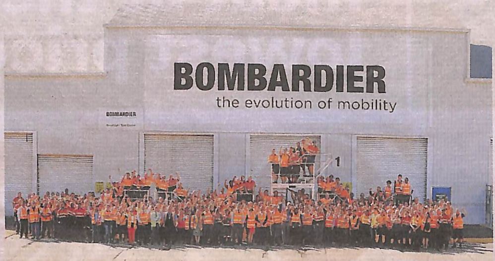
Bombardier Transportation's Dandenong team.

"If this is the case, what then happens to the local supply chain that currently supplies the majority of components for the carriage assemblies?"