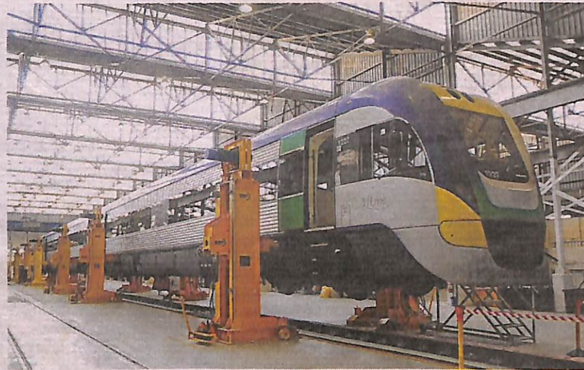
A Bombardier VLocity train.

"We welcome the government's announcement for the 21 new VLocity cars with more than 60 per cent local content