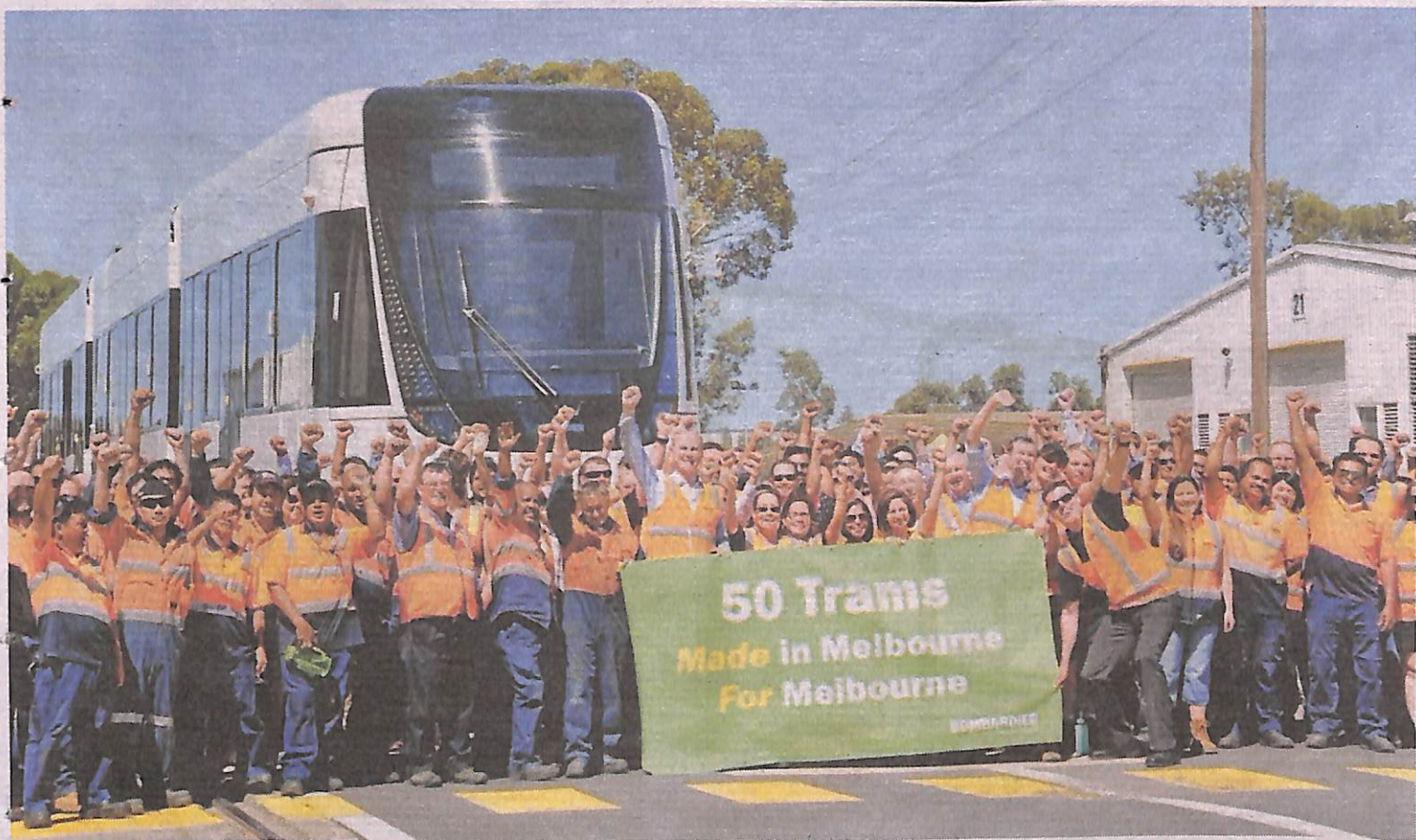
Bombardier workers celebrate the completion of the 50th E-Class tram. 165488