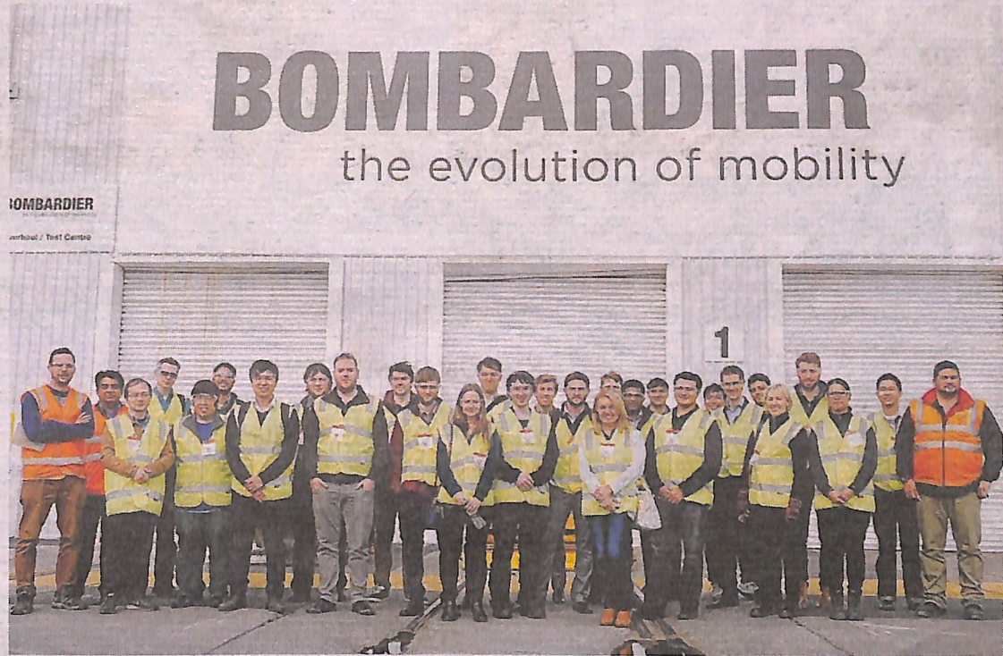
Young Transport Professionals Network tours Bombardier Transportation Australia.