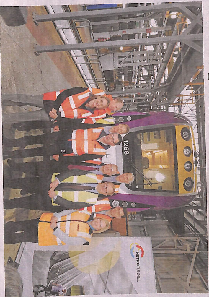
Premier Daniel Andrews attended for the official launch.

Bombardier declined to comment on the announcement at this time, because it's officially the "preferred proponent" at this point in time.