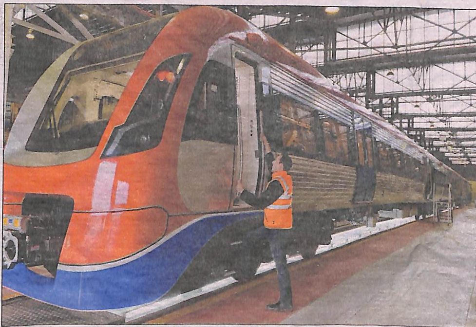
Bombardier in Dandenong has built 22 electric trains bound for Adelaide.