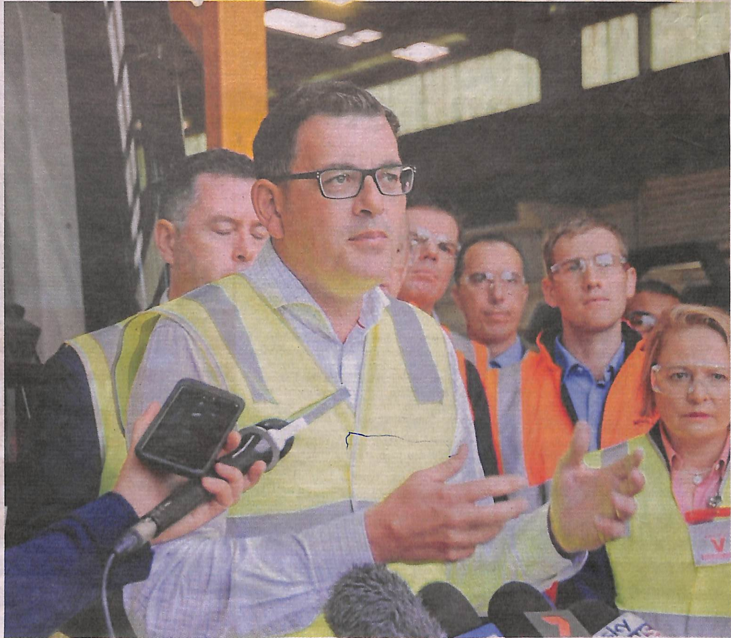
Premier Daniel Andrews speaks at Bombardier last month.

"Five hundred livelihoods depend on these orders."