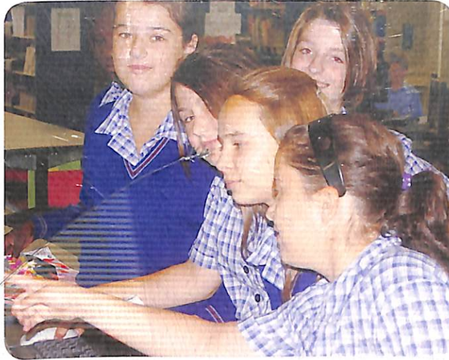
Bronwyn Pike MP Minister for Education