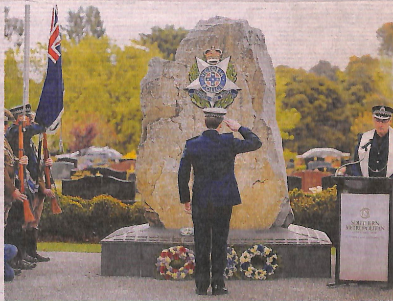
A police officer salutes after laying a wreath. 144455

The lowering of the Police Flag to half-mast while the Last Post played, a minute’s silence and the raising of the flag concluded the service.