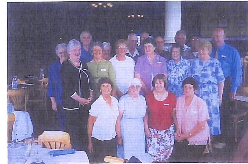
GROUP PHOTO FROM FEBRUARY 2007 'BIRTHDAY/REUNION' AT CRANBOURNE