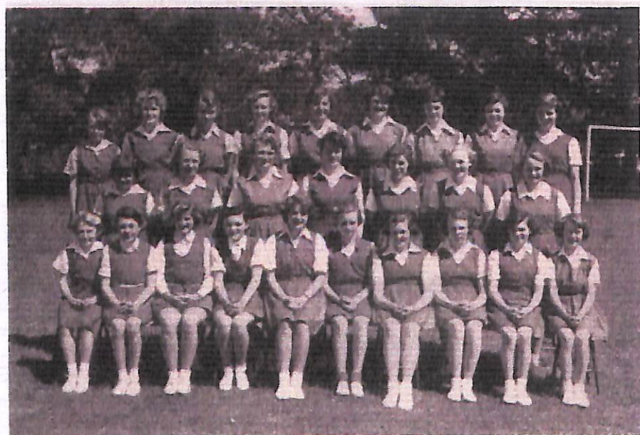
GIRLS' SWIMMING TEAM