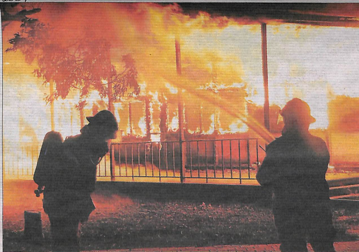
All ablaze: CFA firefighters tackle the intense flames at the former Doveton Secondary College.