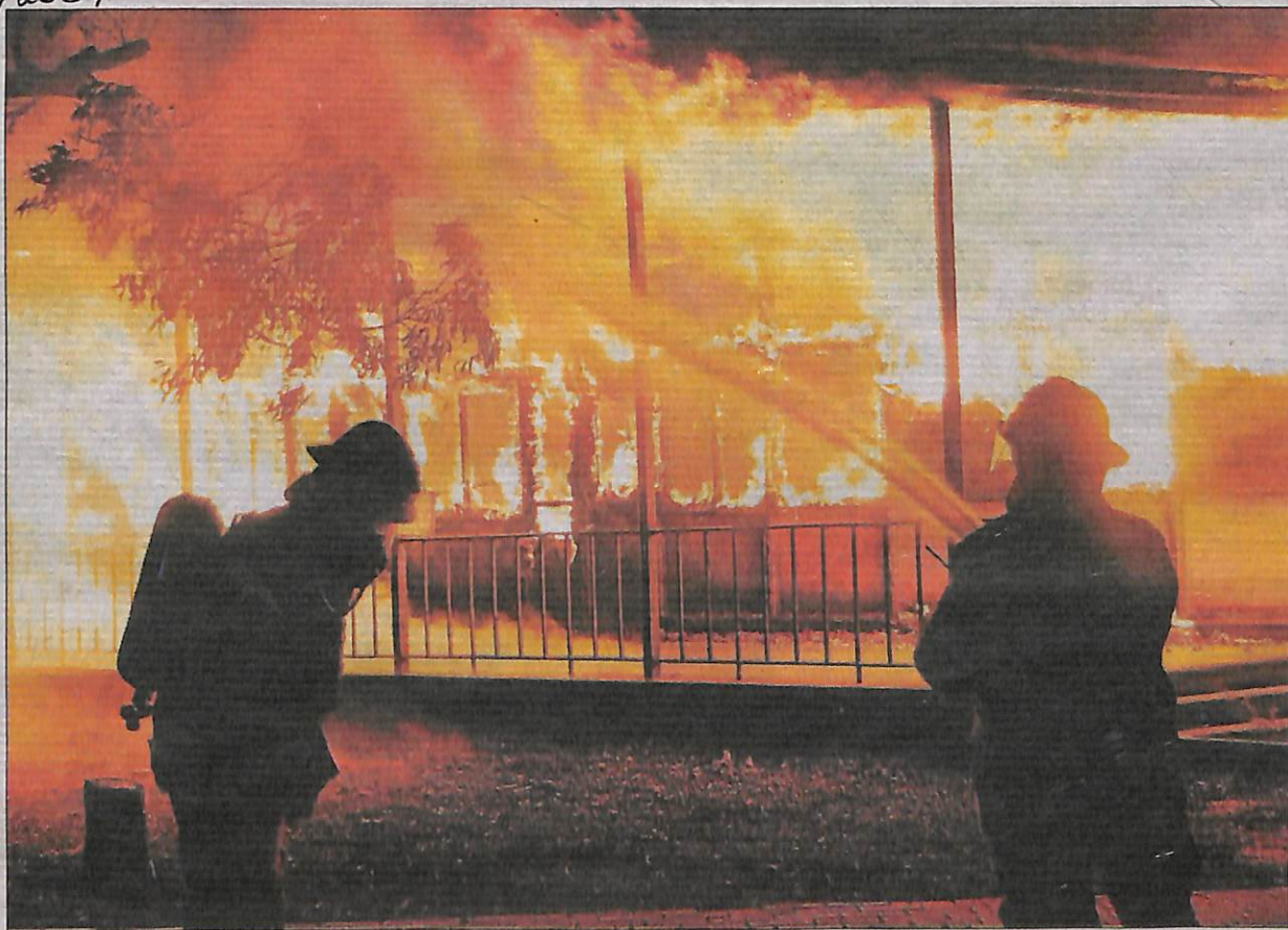
All ablaze: CFA firefighters tackle the intense flames at the former Doveton Secondary College.