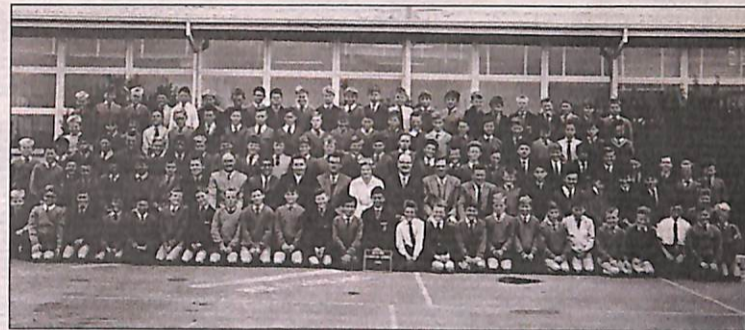
Past students and their families are invited to mark the close of Doveton Secondary College, which served the area for 45 years.