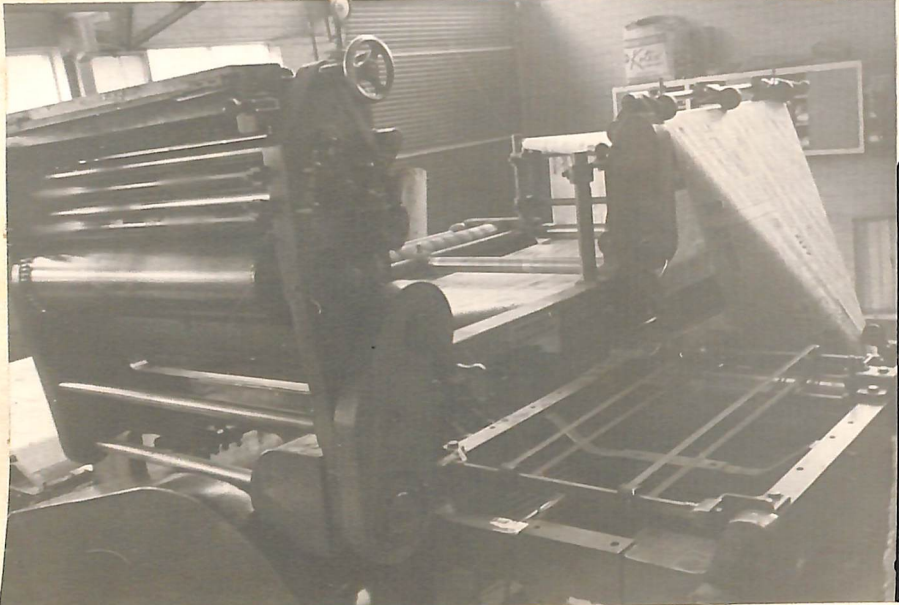
ABOVE : View of Press from front left showing web at centre crossing transport rollers and angle bars to guiding cylinders and down former.