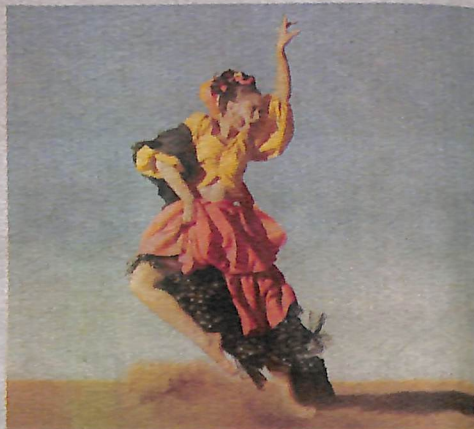
Opera Australia is touring with a production of Carmen.