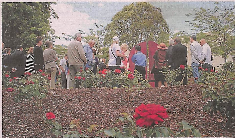
In bloom: Many people turned out to enjoy the official opening of the Enterprise Hostel rose and sculpture garden.

The Spirit of Enterprise Project, led by members of the Springvale community, has been described as having national significance, with several leading Australians formally endorsing the project.