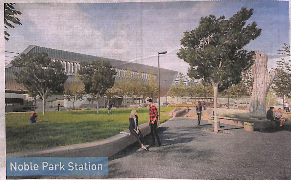
An artist's impression of the new Noble Park Railway Station.

She spoke out after the State Government revealed new designs for the parkland, which included a 1275 square metre fenced dog park, walking paths and 100 extra car spaces for commuters.