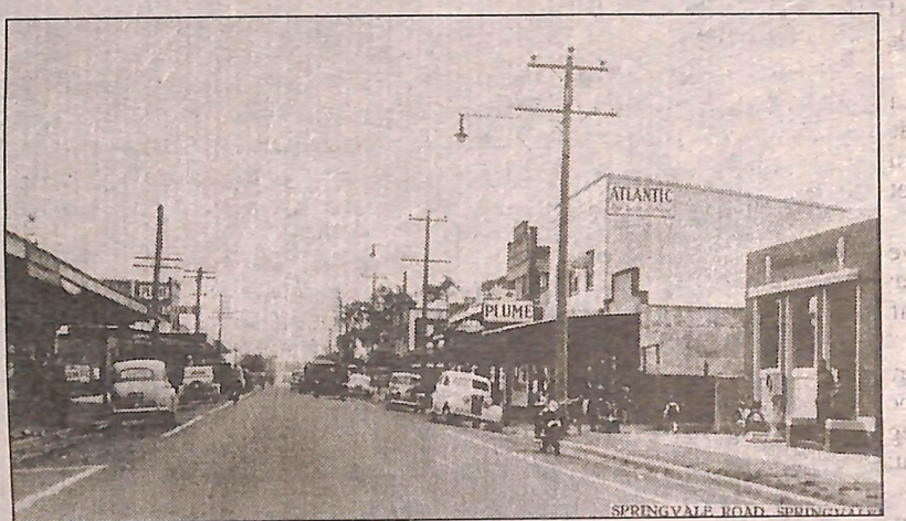
The '50s: Springvale Rd pictured in 1952.