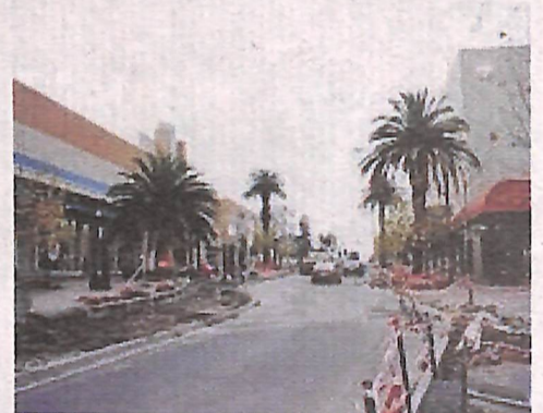
Looking towards Foster Street from Myer in June 1993.