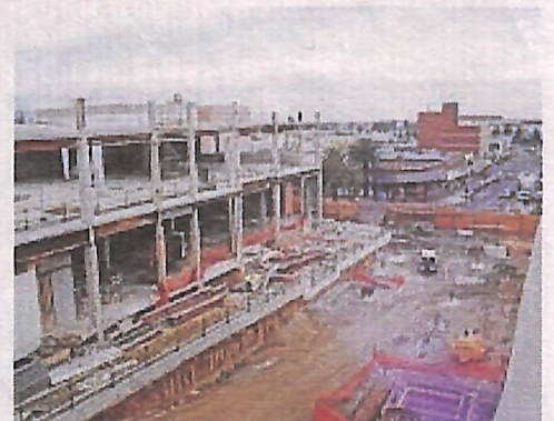
Construction work to develop the link between Myer and the Capital Centre in 1995.