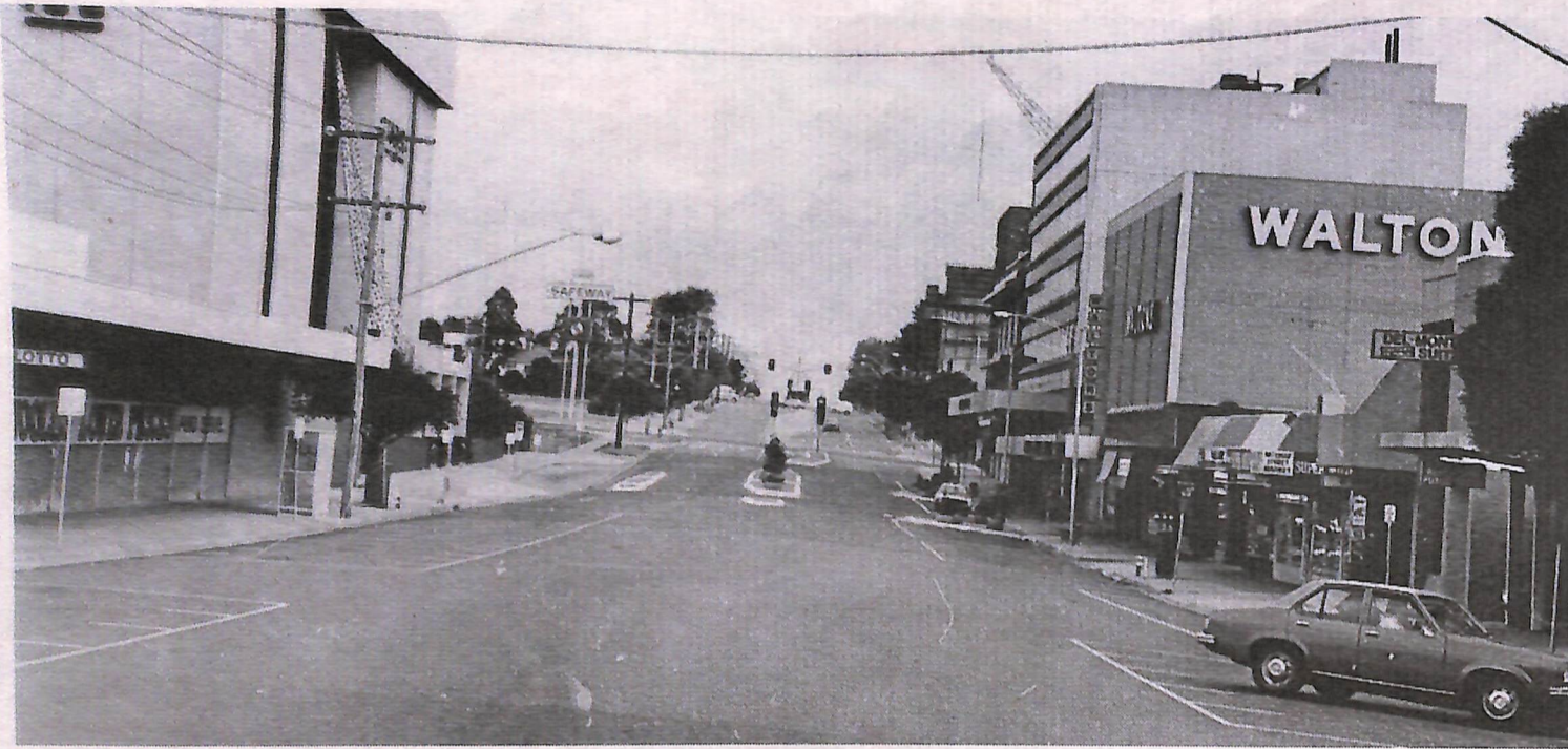
McCrae Street looking east towards Walker Street.