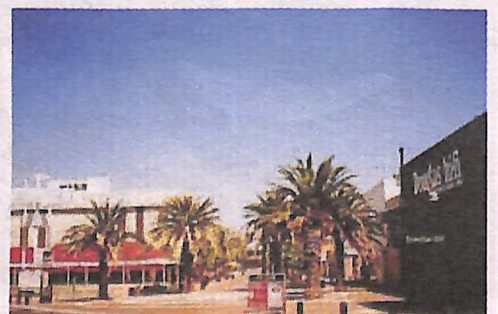
Palm Plaza in 1995.