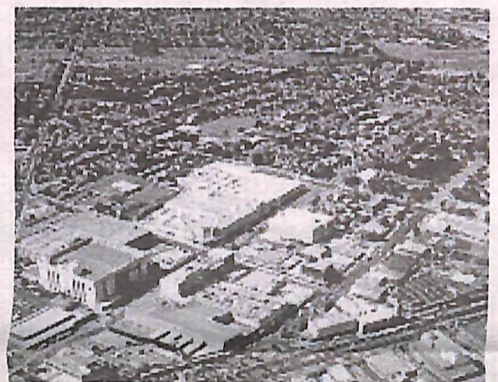
Aerial view of Myer and the Capital Centre in 1991.

For more information visit www.armadadandenongplaza.com.au