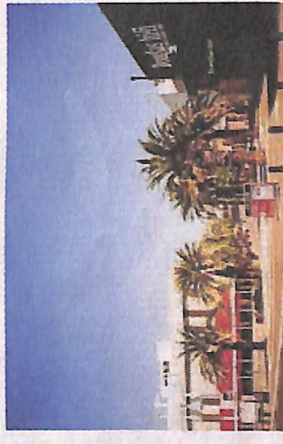
Palm Plaza in 1995.