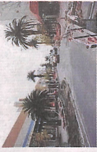
Looking towards Foster Street from Myer in June 1993.