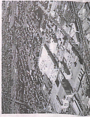
Aerial view of Myer and the Capital Centre in 1991.

For more information visit www.armadadandenongplaza.com.au