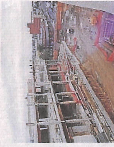
Construction work to develop the link between Myer and the Capital Centre in 1995.