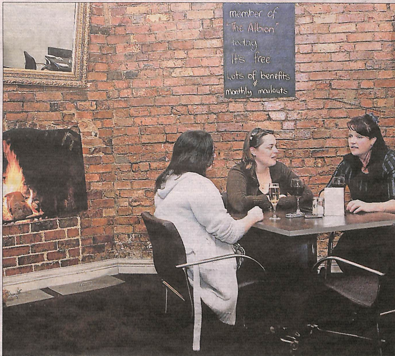
Comfortable dining: The warm atmosphere and friendly service at The Albion will ensure that every visit is a memorable one.

The Albion Hotel, at 327 Lonsdale Street, Dandenong, is open Monday-Friday from 8am, Saturdays from 9am and Sundays from 10am. Breakfast is available weekdays from 8.30-10.30 and 9.30-11.30 Saturday and Sunday. Lunch is from noon-2.30pm seven days and dinner from 6-8.30pm Sunday-Thursday and 6-9pm Friday-Saturday. Details and bookings: 9792 2501.