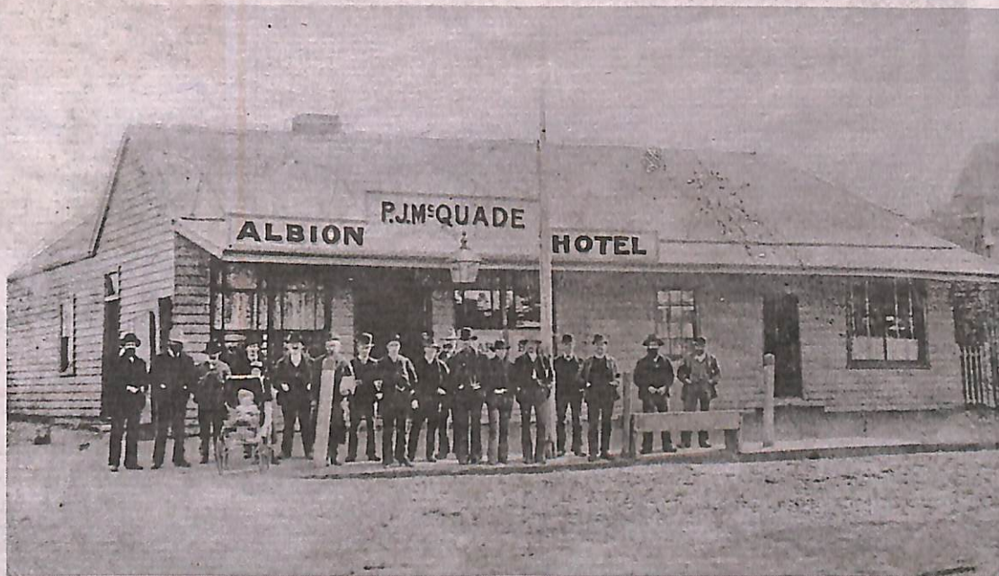
An early incarnation of the McQuade family's Albion Hotel.

changed - "the stairway and everything" - but the facade was still the same and is subject to heritage protections.