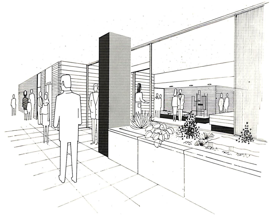
New Administrative Offices 122-138 Thomas St. DANDENONG