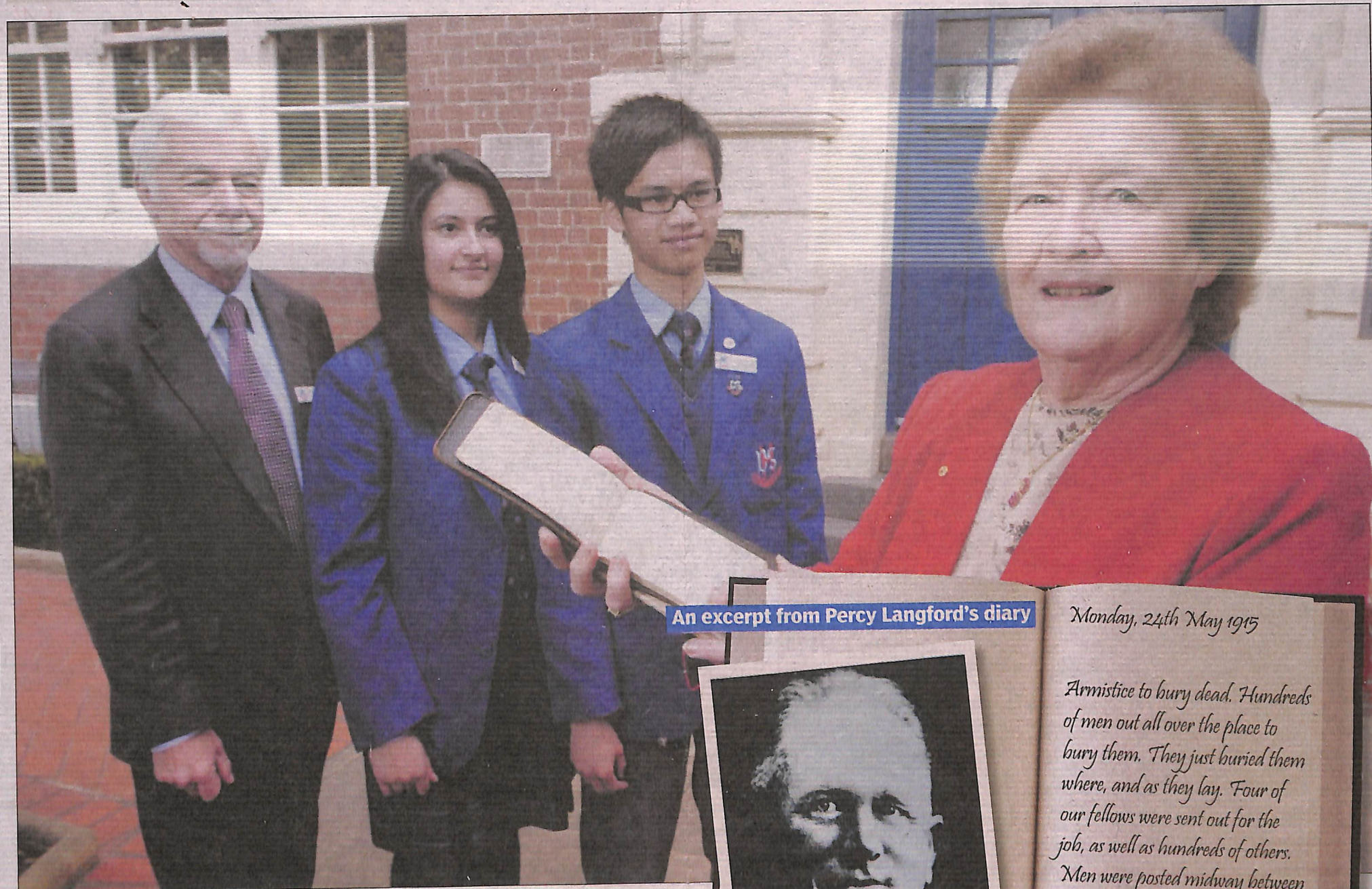
An excerpt from Percy Langford's diary