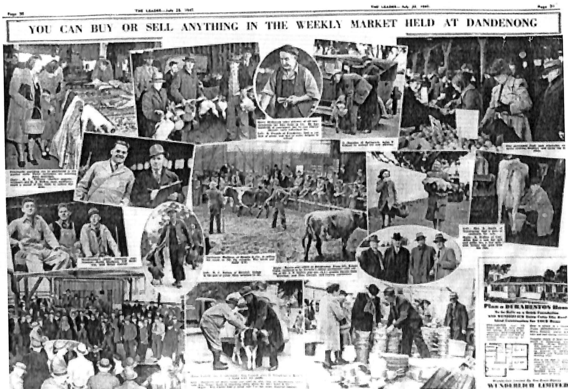
"You can buy or sell anything in the weekly market...", photographs at the Clow Street market, The Leader 1947.