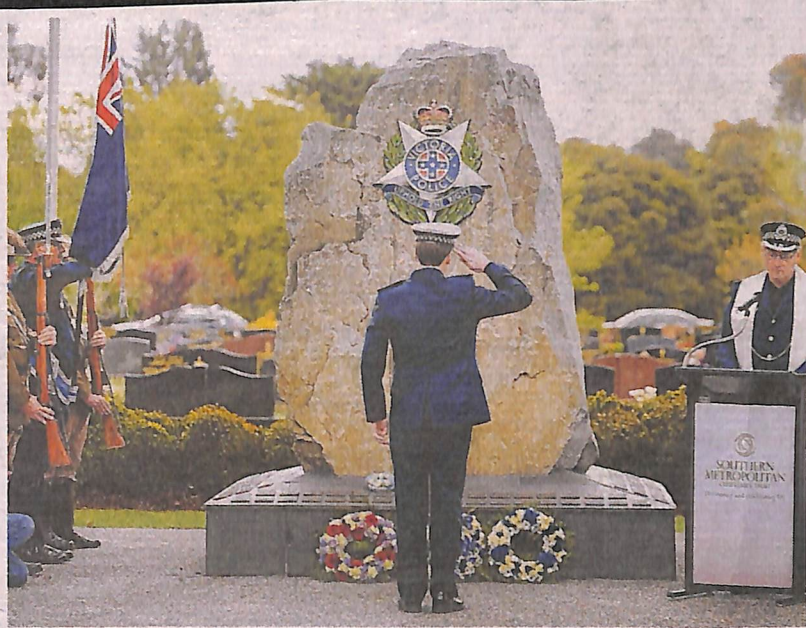
A police officer salutes after laying a wreath. 144455

The lowering of the Police Flag to half-mast while the Last Post played, a minute's silence and the raising of the flag concluded the service.