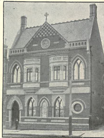
ADULT DEAF & DUMB BUILDING, FLINDERS STREET EAST, HEAD-QUARTERS OF THE ABOVE MISSION.