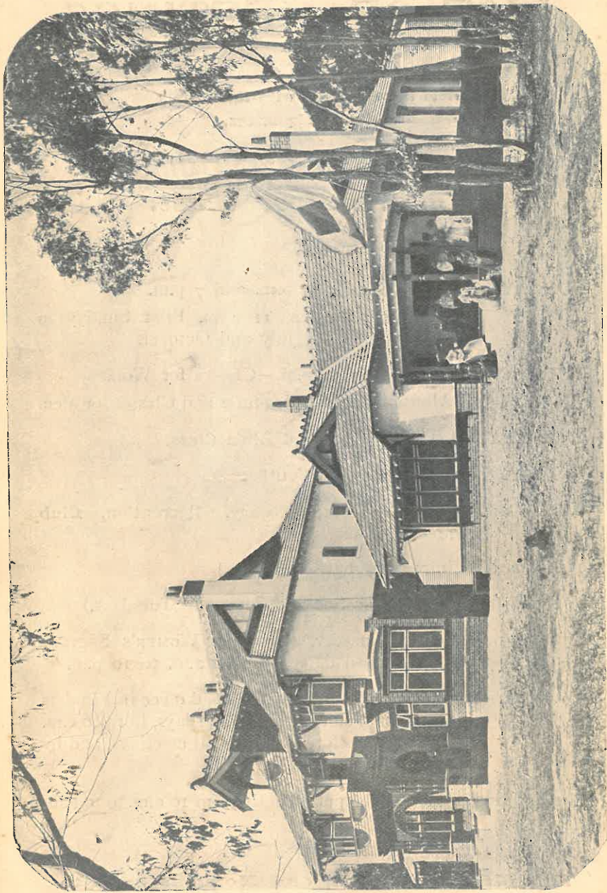
Blackburn Home for Aged and Infirm Deaf Mutes.