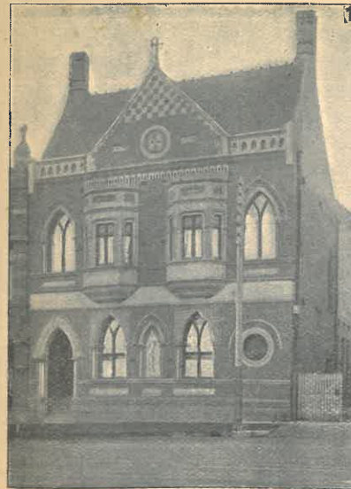
ADULT DEAF & DUMB BUILDING, Flinders Street East. Headquarters of Society.

ADULT DEAF SOCIETY OF VICTORIA 101 Wellington Pde. Sth., Melbourne East, 3002