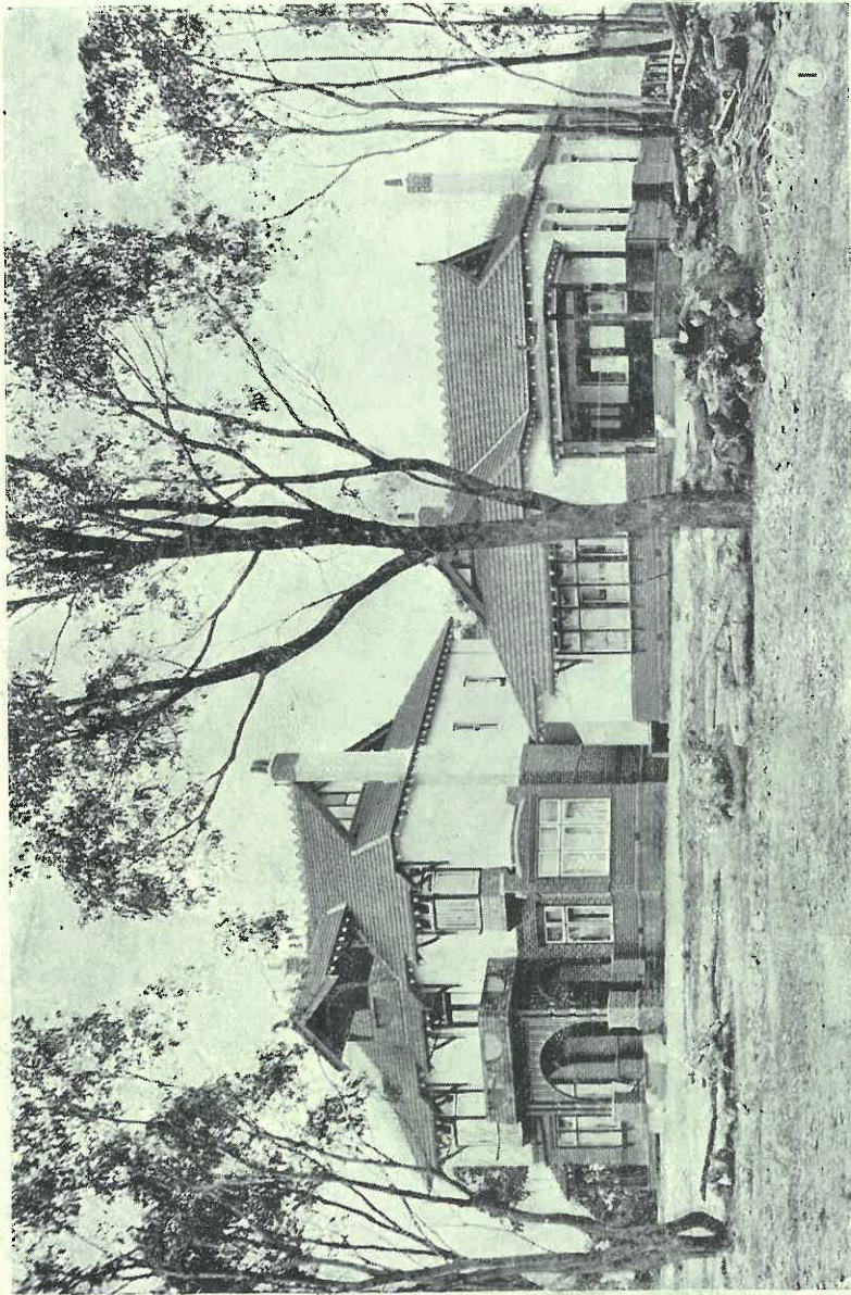
Blackburn Home for Aged and Infirm Deaf Mutes

ADULT DEAF SOCIETY OF VICTORIA 101 Wellington Pde. Sth., Melbourne East, 3002 TELEPHONE 5223 CENTRAL