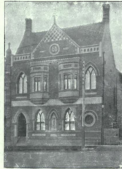
ADULT DEAF AND DUMB CENTRE 32-34 FLINDERS STREET EAST, MELBOURNE HEADQUARTERS OF SOCIETY

ADULT DEAF SOCIETY OF VICTORIA 101 Wellington Pde. Sth., Melbourne East, 3002 TELEPHONE 5223 CENTRAL