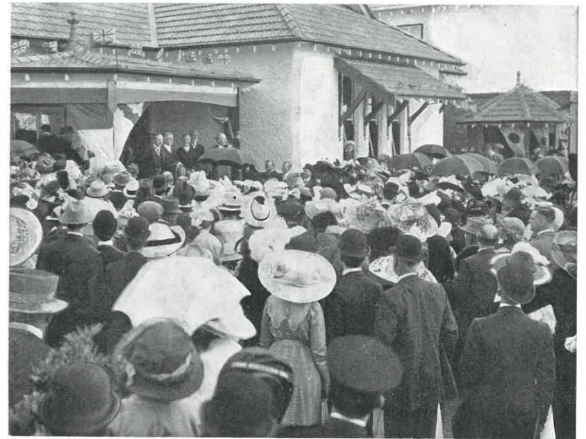
The Governor-General declaring the Women's Wing open.

provides training and employment for that section of the deaf and dumb who, by reason of mental or physical defects, are unable to follow ordinary occupations, and a home for aged infirm and blind deaf mutes.