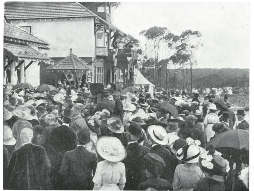
Some of the Guests at the Opening Ceremony.

Opening of the Women's Wing of the Blackburn Home for Deaf Mutes by His Excellency the Governor-General, Nov. 23rd, 1912.