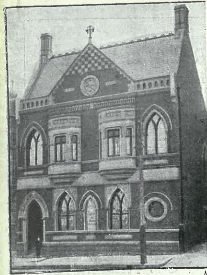
ADULT DEAF & DUMB BUILDING, 32-34 Flinders Street East. Headquarters of Society.