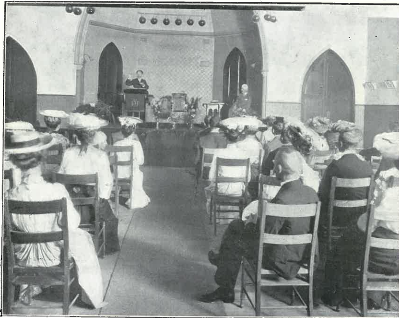
Interior of Church for Deaf Mutes, Flinders Street East. The Service is being conducted in the finger and sign language.