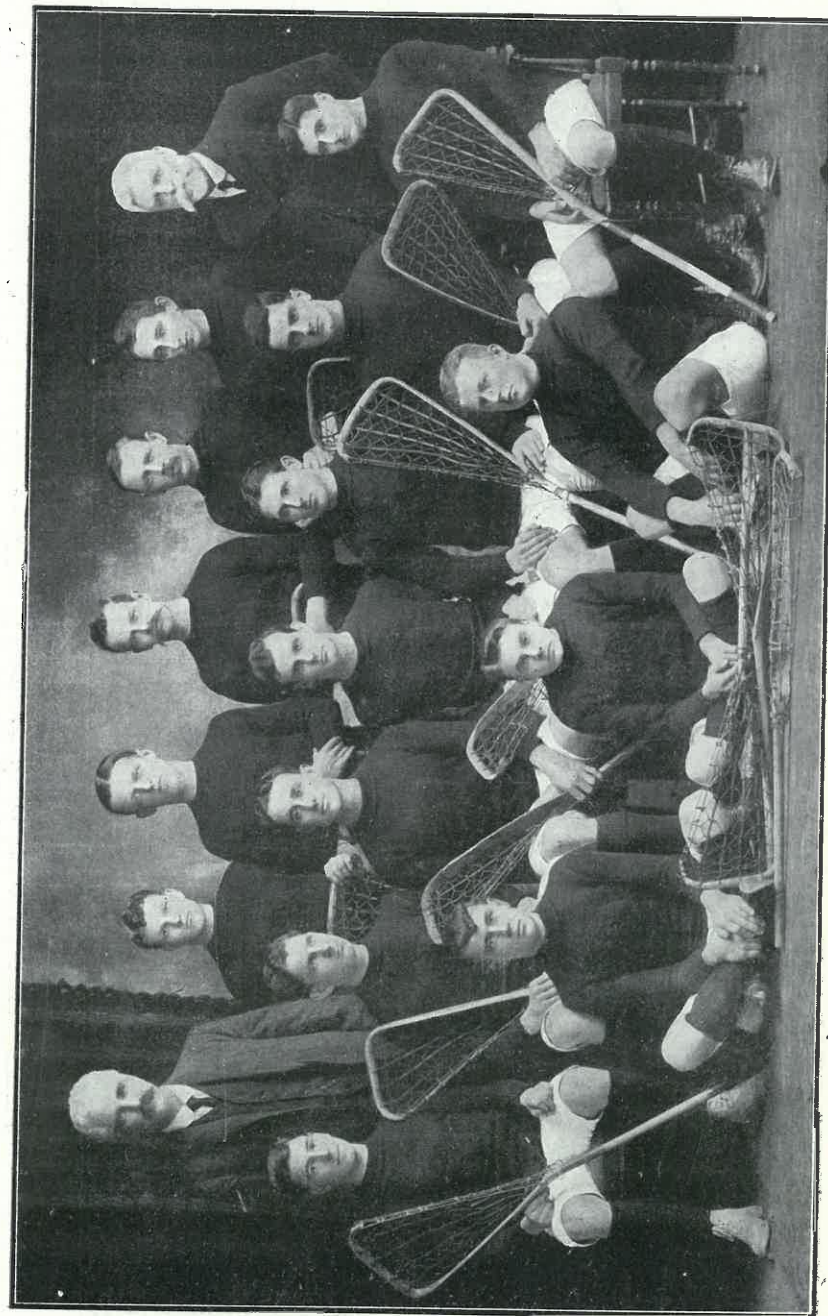
Adult Deaf and Dumb Society Lacrosse Club.

The Blackburn Farm and Home is open to Visitors on Wednesday and Saturday Afternoons.