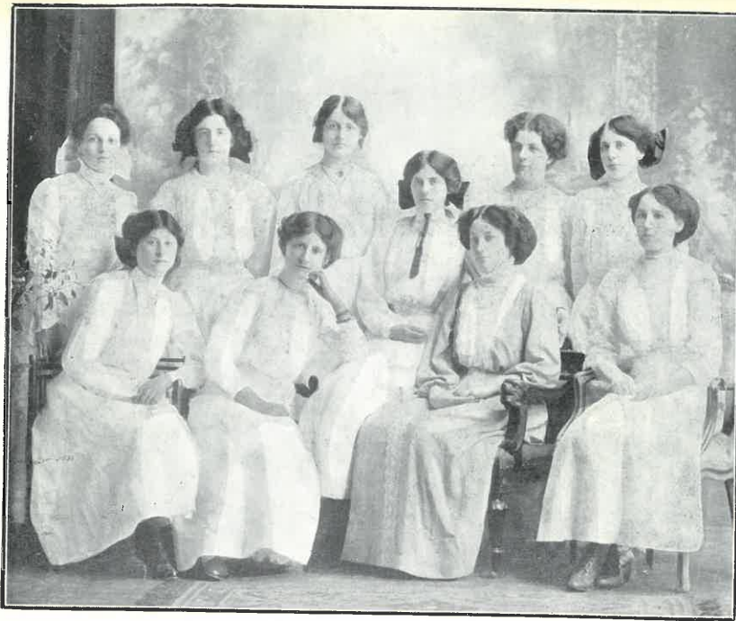
A Group of a few of the younger Members of the Deaf Mute Women's Guild.