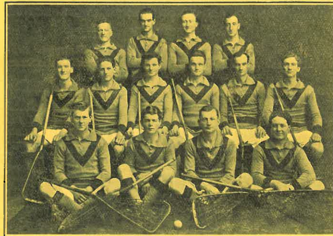
ONE OF THE DEAF MUTE LACROSSE TEAMS.