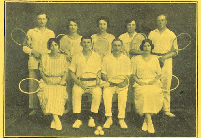
OUR DEAF MUTE TENNIS CLUB COMMITTEE.

I request the to the Director for the time being of which that our Deaf Mute Society of Victoria, for the one of the most serious for which the receipt of such requests should be a sufficient this date