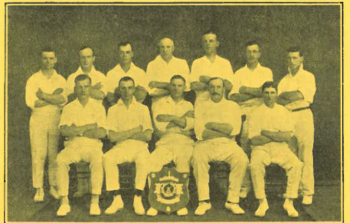
OUR VICTORIAN DEAF MUTE CRICKET TEAM. (Winners of the E. J. D. Abraham Shield, 1926.)