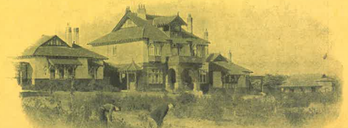
THE HOME FOR AGED, INFIRM, MENTALLY DEFECTIVE, AND BLIND DEAF MUTES AT BLACKBURN

This Society is NOT CONNECTED with the Victorian Deaf and Dumb Institution, which is a RESIDENTIAL SCHOOL for Deaf and Dumb CHILDREN