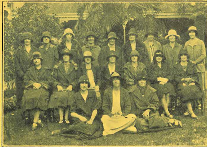
SOME MEMBERS OF OUR DEAF WOMEN'S GUILD.