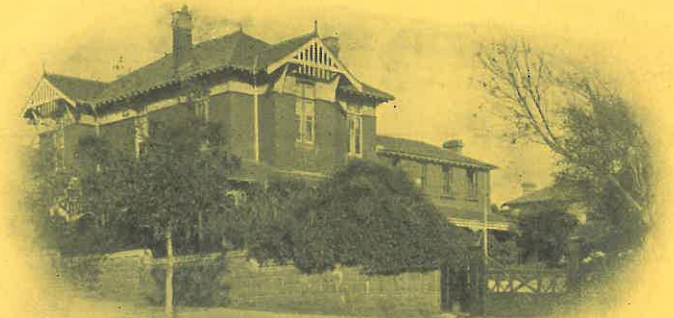
NEW ADULT DEAF MUTE CENTRE, JOLIMONT SQUARE