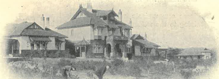
THE HOME FOR AGED, INFIRM, MENTALLY DEFECTIVE, AND BLIND DEAF MUTES AT BLACKBURN

This Society is NOT CONNECTED, with the Victorian Deaf and Dumb Institution, which is a RESIDENTIAL SCHOOL for Deaf and Dumb CHILDREN