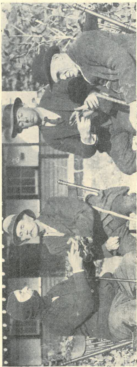
Blind Deaf and Dumb Inmates of the Blackburn (Vic.) Home conversing on each other's hands