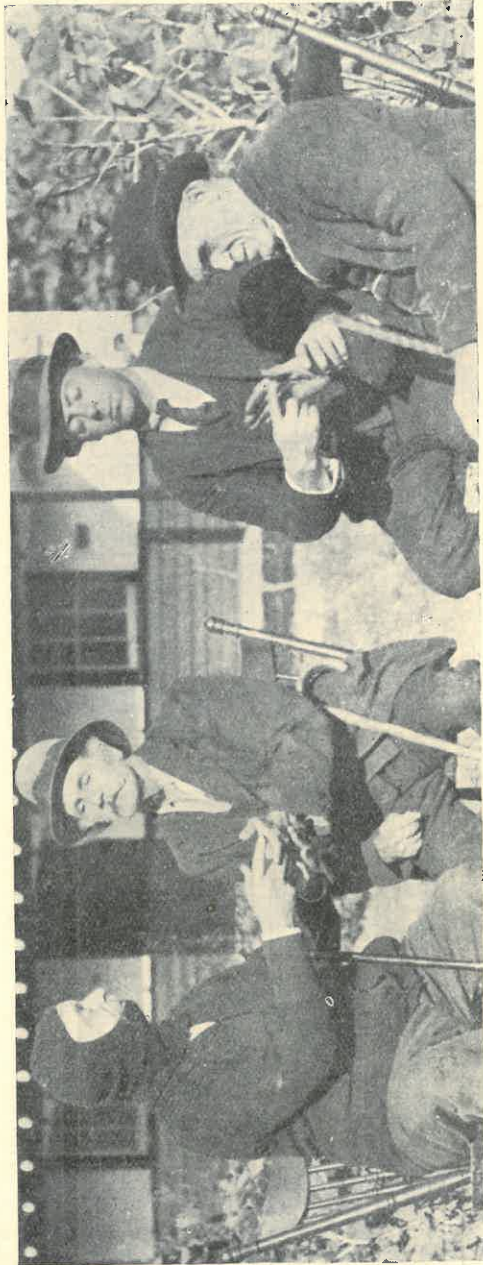
Blind Deaf and Dumb Inmates of the Blackburn (Vic.) Home conversing on each other's hands