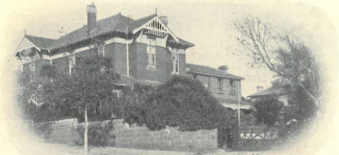
NEW ADULT DEAF MUTE CENTRE, JOLIMONT SQUARE