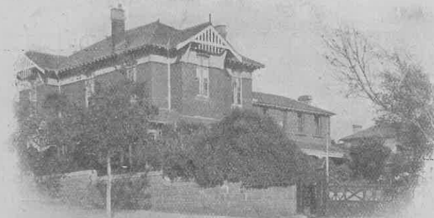
ADULT DEAF MUTE CENTRE, JOLIMONT SQUARE, MELB. HEADQUARTERS OF THE SOCIETY

Peacock Bros. Pty. Ltd., 486-490 Bourke St., Melbourne