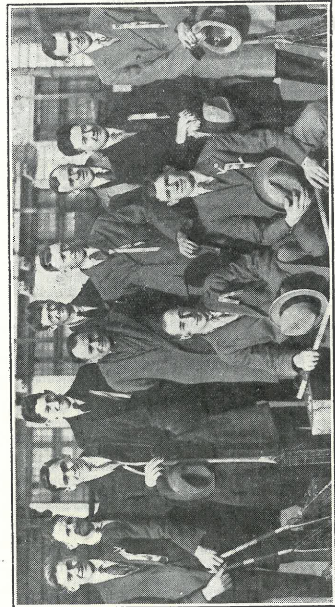
VICTORIAN ADULT DEAF LACROSSE TEAM