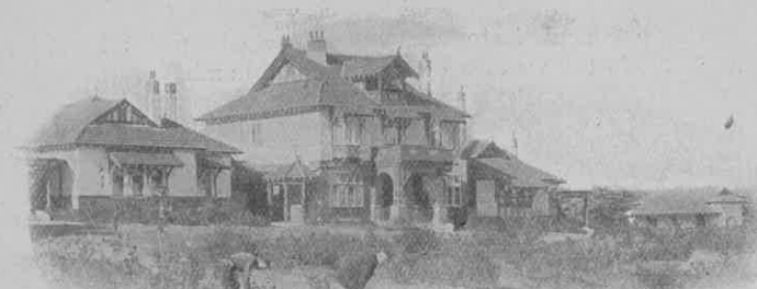
THE HOME FOR AGED, INFIRM, MENTALLY DEFECTIVE, AND BLIND DEAF MUTES AT BLACKBURN

This Society is NOT CONNECTED with the Victorian Deaf and Dumb Institution, which is a RESIDENTIAL SCHOOL for Deaf and Dumb Children