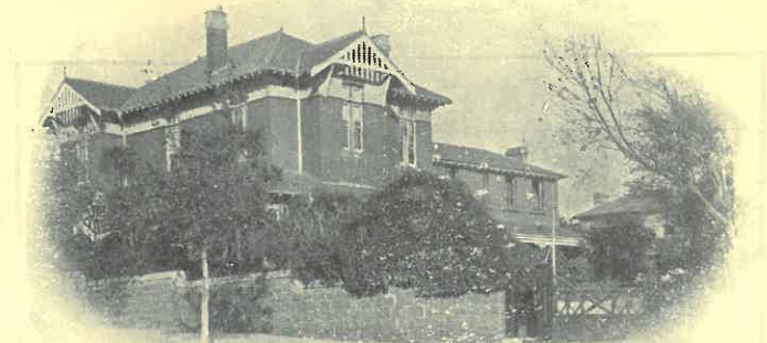
ADULT DEAF MUTE CENTRE, JOLIMONT SQUARE, MELB. HEADQUARTERS OF THE SOCIETY.