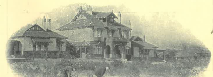
THE HOME FOR AGED, INFIRM, MENTALLY DEFECTIVE, AND BLIND DEAF MUTES AT BLACKBURN

This Society is NOT CONNECTED with the Victorian Deaf and Dumb Institution, which is a RESIDENTIAL SCHOOL for Deaf and Dumb Children