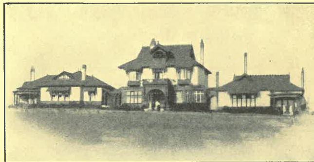
Homes for Aged, Infirm, and Dependent Deaf Mutes, Blackburn.

This Society is NOT CONNECTED with the Victorian Deaf and Dumb Institution, which is a RESIDENTIAL SCHOOL for Deaf and Dumb Children