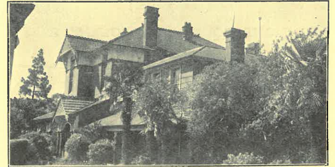
Adult Deaf and Dumb Social Welfare Centre and Headquarters of the Society, Jolimont, Melbourne East.