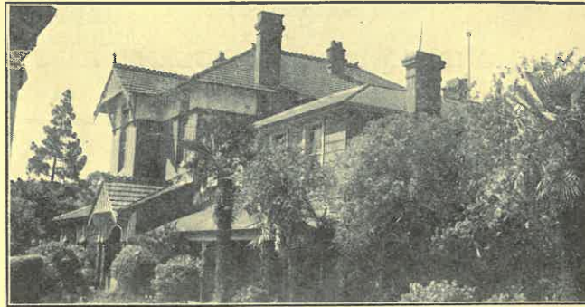
Adult Deaf and Dumb Social Welfare Centre and Headquarters of the Society, Jolimont, Melbourne East.