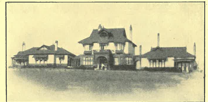
Homes for Aged, Infirm, and Dependent Deaf Mutes, Blackburn.

This Society is NOT CONNECTED with the Victorian Deaf and Dumb Institution, which is a RESIDENTIAL SCHOOL for Deaf and Dumb Children