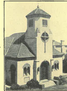
Church for the Deaf and Dumb.