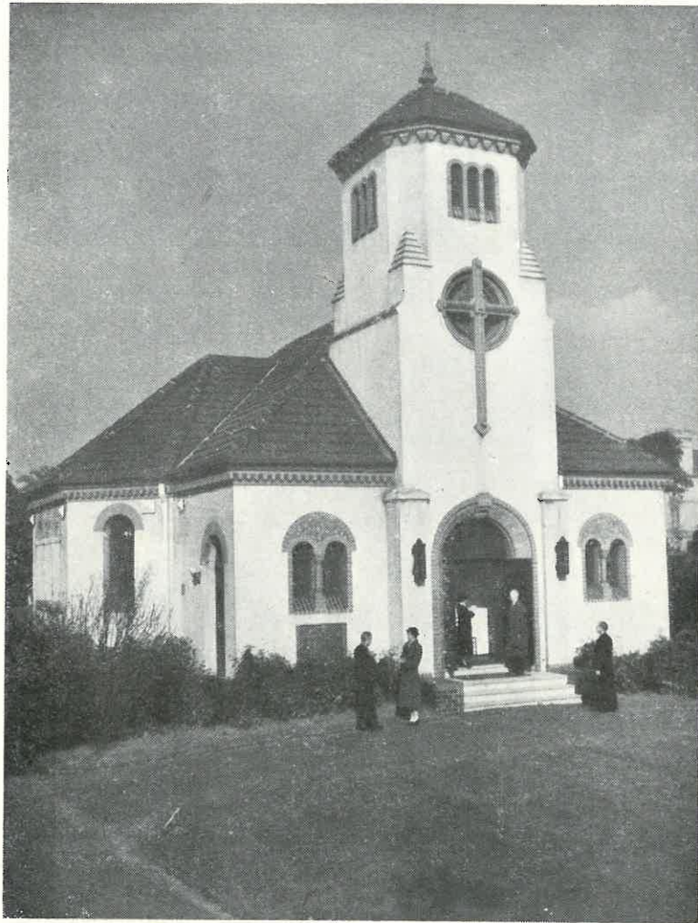
CHURCH FOR THE DEAF AND DUMB, JOLIMONT, MELBOURNE EAST.

Acclaimed by overseas authorities as being one of the nicest Deaf Churches in the world.