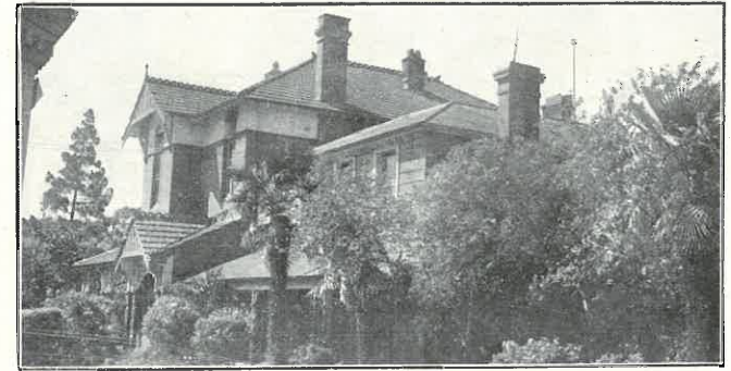
Adult Deaf and Dumb Social Welfare Centre and Headquarters of the Society, Jolimont, Melbourne East.