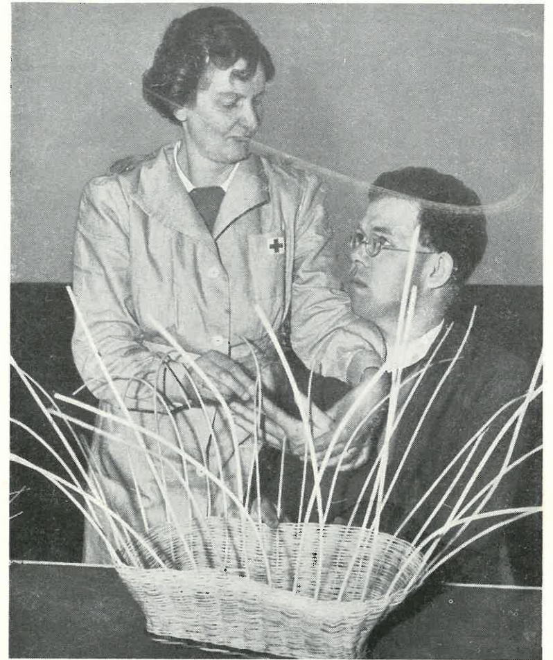
Red Cross Worker Instructs Deaf, Dumb and Blind Man in Craft Work at Blackburn Home.

Acclaimed by overseas authorities as being one of the nicest Deaf Churches in the world.