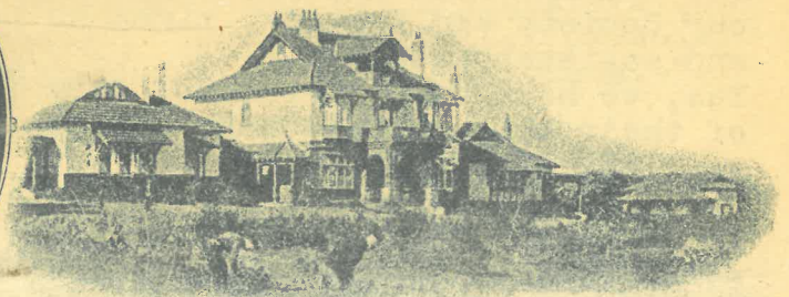
HOME FOR AGED, INFIRM, MENTALLY DEFECTIVE, AND BLIND DEAF MUTES. BLACKBURN. VIC.