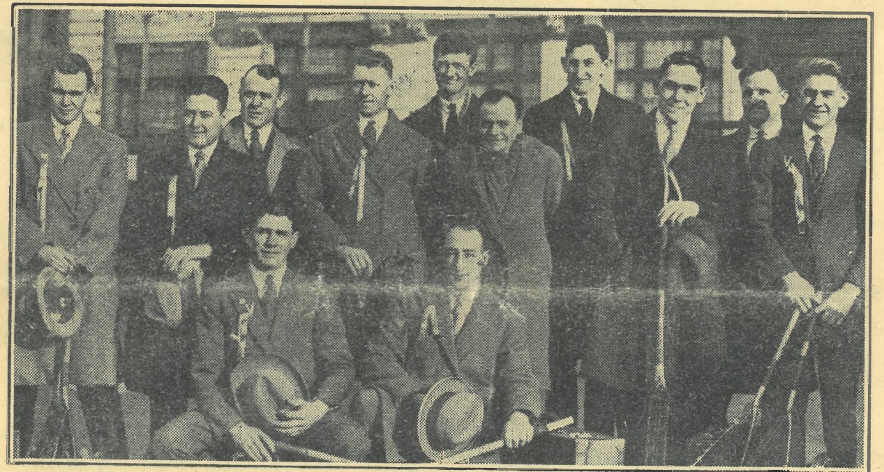
VICTORIAN ADULT DEAF LACROSSE TEAM

"In the universe an influence is astir and always has been, that develops higher forms of life, purer tastes, nobler aspirations, and makes living things, including men and women, sacrifice themselves, often unconsciously, to the heroic. It is veiled and not clearly seen, but exists everywhere. It is the same that was meant in the first book of the Bible, when the writer said, "The Spirit of God moved on the face of the waters."