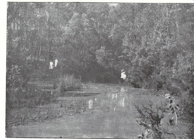
FAIRYLAND WITHIN EASY DISTANCE OF MELBOURNE