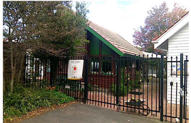
ENTRANCE, FORMER METHODIST MEN'S FELLOWSHIP HALL