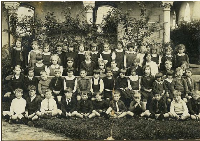
ST ANDREW'S JUNIOR SCHOOL, c.1926

Modifications and additions to the existing buildings were made, approved by the Education Department and opened in June 1922. New tennis courts were built in 1925. By now there were 176 pupils.