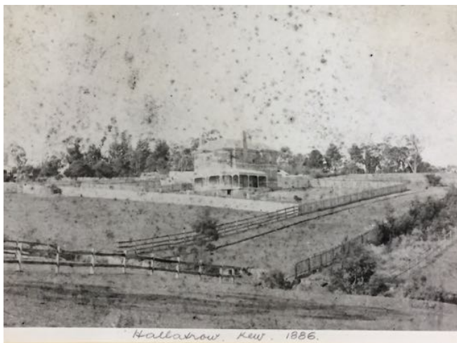
HALLATROW, KEW, 1886 Gift of Gregor Evans, 2020

As a resident of Studley Ward, but on the south side of Studley Park Road, a swift trip by car to view the house became necessary. Unfortunately the aspect from the street of the house was obscured by a high front fence and hedged trees. An aerial view using Google maps gave some idea of the size of the house, but its landholding was strictly diminished from that shown in one of the photographs of the house [below] that formed part of the donation.