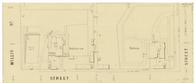
[Extract] MMBW DETAIL PLAN NO. 1346 (1904)