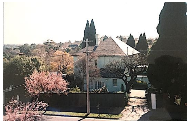
HALLATROW, 6 HOLROYD STREET

The Evans family took a number of photographs of the house during the period of their ownership. The interior photographs depict gracious, large rooms with ceilings that were lowered at a date post construction.