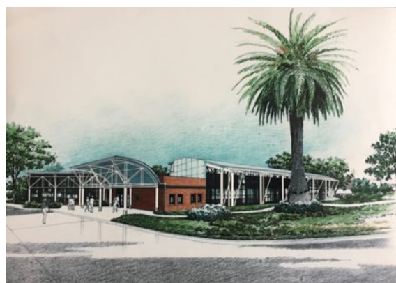
ARCHITECTURAL SKETCH FOR THE NEW KEW RECREATION CENTRE, 1986