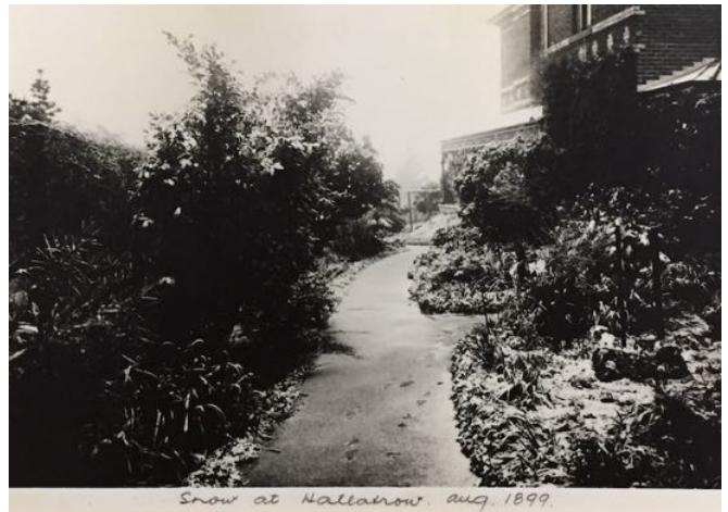
SNOW AT HALLATROW, AUG 1899 Gift of Gregor Evans, 2020

The photograph, while difficult to interpret due to fading and old foxing, shows the two-storey house surrounded by paddocks. Given the slope of the land, the camera must have been positioned to the northwest of the house, looking up towards the corner of Holroyd and Barry Streets. The photograph does not reveal the extent of the ownership of all of the treeless paddocks. All the land bounded by Holroyd Street, Princess Street, Wills Street and the Yarra River had once comprised Crown Land Allotments 60 and 61, purchased by Thomas Wills in 1845 and 1847, and used for farming until the