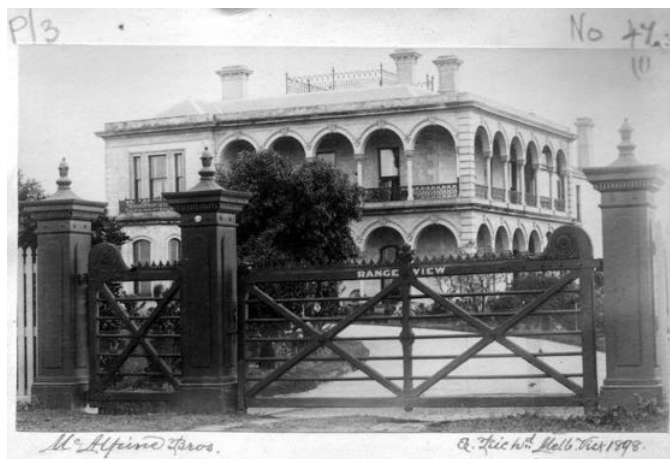
RANGE VIEW.