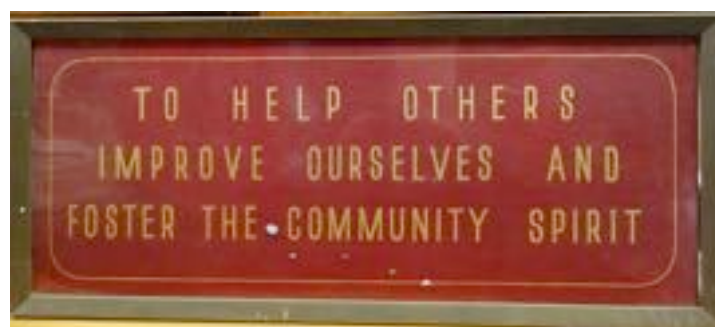
Framed enamel sign, East Kew Women's Club, c.1945.

The Kew Elder Citizen's Association was formed when the Club identified many elderly residents in need of support.