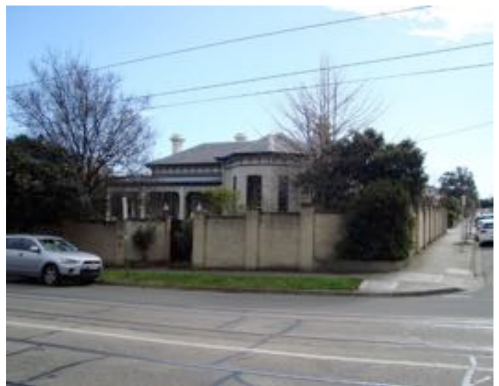
Jamieson family home - Nirvana , 45 Cotham Road, Kew, cnr. Union Street.