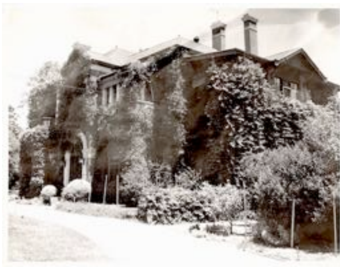
Monnington, Adeney Avenue, c.1965.