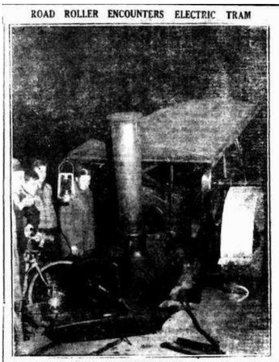
ROAD ROLLER COMES OFF SECOND BEST.—An electric tramcar in Cotham road. Kew. near Glenferrie (cad, on Monday came out of a conflict practically undamaged after wre cking a steam roller. The front roller was torn completely off.

The names of the steamroller and tram drivers were not reported this time. The tram driver apparently had not seen the roller in the dim light until it was too late to avoid a collision. Despite applying the brakes, the tram struck the front roller, breaking the cast metal fork holding its two sections, carrying away the roller and causing the front of the machine to collapse onto the road. No injury to the steamroller driver was reported. The glass screens on the driver's cabin of the tram were shattered but the tramdriver was uninjured, and although several passengers were dislodged from their seats and all received a severe jolt, none were injured.