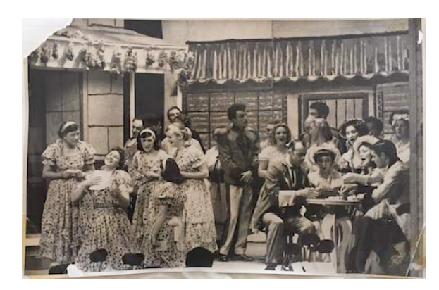
Q Theatre Guild Cast members in a performance of 'Blossom Time', c.1959, in the Kew Recreation Hall.

Before television, and later the Internet, dominated people's lives, individuals, families and groups made their own entertainment. Some joined community groups such as orchestras, bands and theatre companies, sometimes in the foreground as performers or in backstage support roles.