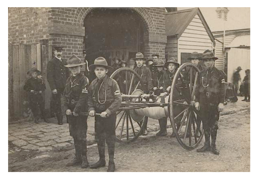
Fire Drill, Kew Fire Station, before 1919.

1st Kew Scouts undertaking a fire drill in front of the old Kew Fire Station in Walton Street. The Kew Fire Brigade had hand-drawn fire appliances up until 1919 when a motorised vehicle was purchased. The Walton Street fire station, which had been built in 1893, was replaced by the Belford Road station in 1941, and subsequently demolished.