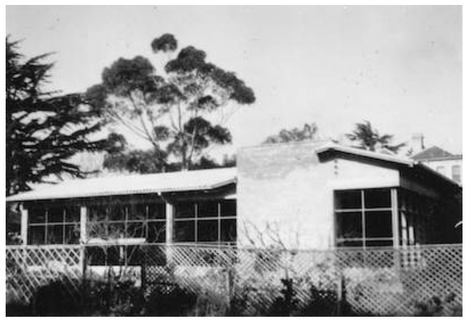
North west view of a 3 bedroom brick home in Kew, from or inspired by a Small Homes Service plan in 1950/ 51.

Owners and builders sometimes added features of interest to the plain walls shown on the working drawings and often extended their homes when necessary.