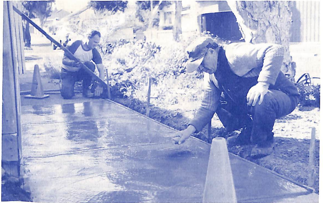
The 1993/94 Budget allocation for footpaths has been tripled following response to the Customer Service Questionnaire.

Other services highlighted by residents as being priorities for Council include the Library, traffic management, the control of development in residential areas, street trees and beautification.