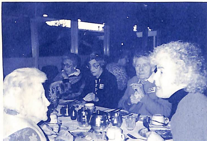
Meals On Wheels recipients enjoy lunch at the Senior Citizens Centre.

Meals are prepared daily at the Senior Citizens Centre and delivered by over 120 volunteers who help weekly, fortnightly or monthly. Some volunteers have been with the service for over 30 years and have seen it grow from the days when meals