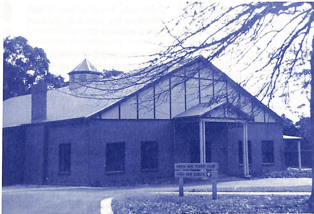
The new Tennis Club and Scout Hall Facilities.

The Hall will be available for some community use, with bookings being taken by the 1st Kew Scout Group.