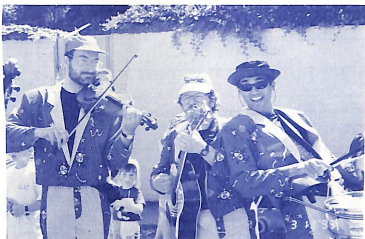
Musicians at the Festival Family Fun Day

Since the committee first convened 20 years ago, many talented people have shared their time and skills with the community by helping to plan the Festival. Perhaps your local organisation or club already participates in the Family Fun Day and you are aware of the great challenge ahead for