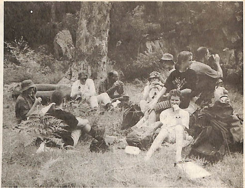
Members of 'Boroondara Bushwalkers' enjoying a snack in the ranges North of Briagalong in Gippsland.

With over 150 members the club caters for both beginners and ad-