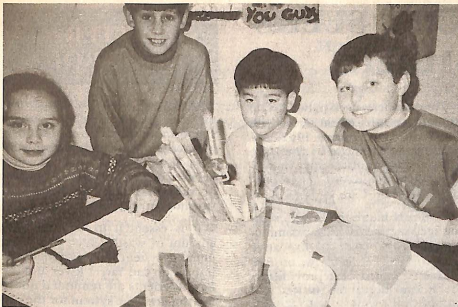
Children painting at Kew Primary School, on a holiday program, earlier this year.