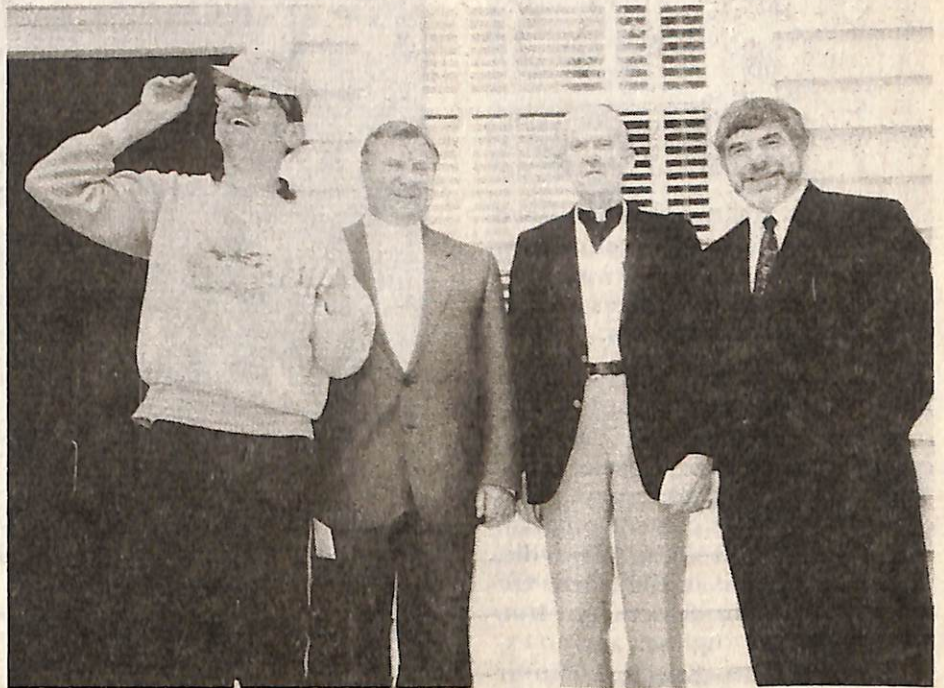
Opening of Kew Cottages Chapel.