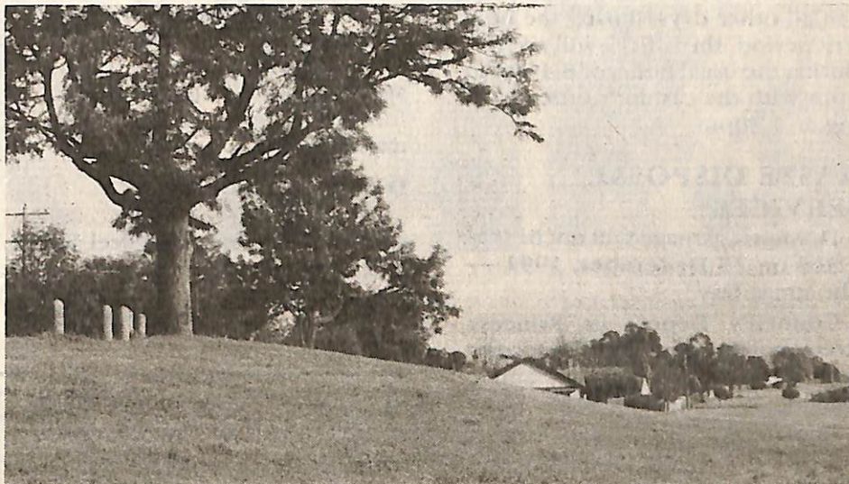
Outer Circle Linear Park.

Along the Yarra, especially behind the National Guide Dog