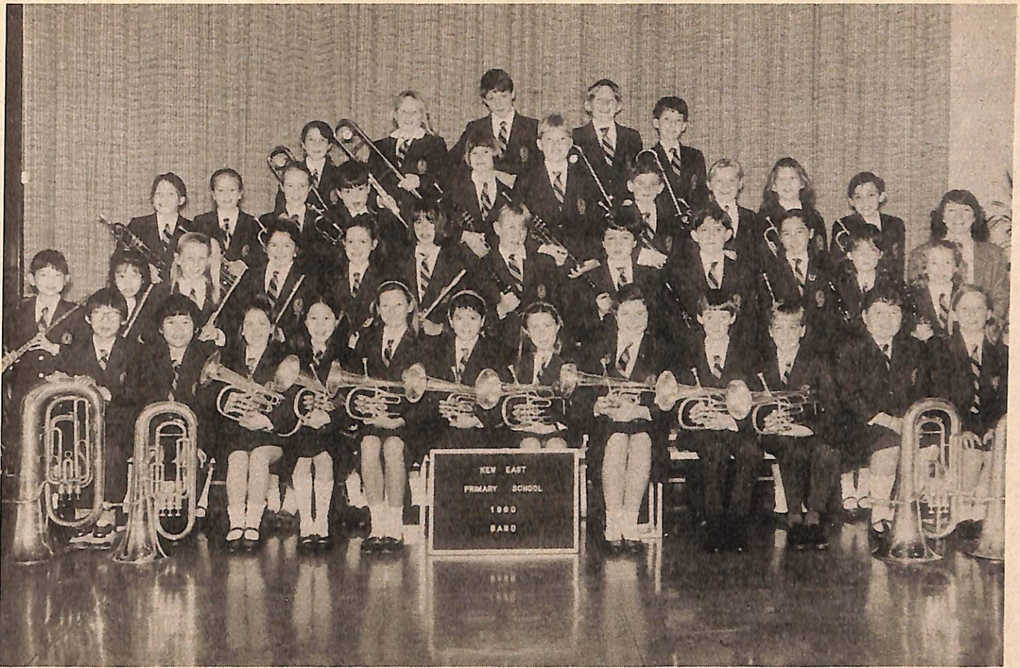
Kew East Primary School Band, 1990.