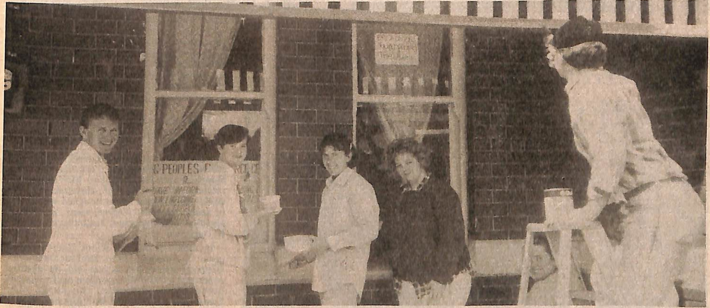
Kew Rotaract Club members help spivie up Kew's Youth Resource Centre in Derby Street.