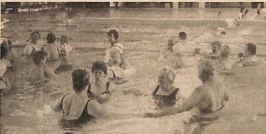
Kew residents enjoy gentle water exercise at Kew Recreation Centre.