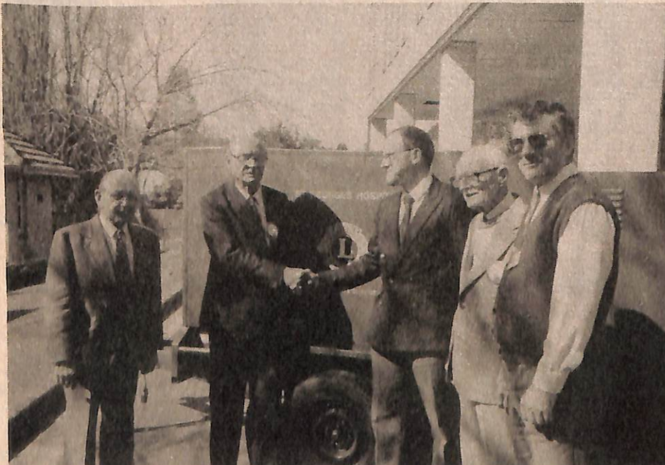
St. George's Hospital receive medical waste trailer donated by Kew Lions Club.