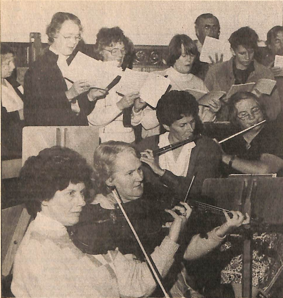
Members of the Kew Philharmonic Society are pictured rehearsing. The Society will present its first subscription concert for the year in the Paton Memorial Uniting Church, Burke Rd, on May 19 at 8pm.