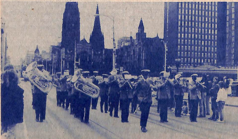
On parade in the city Anzac Day march

The band had an enjoyable weekend at Beaufort in July, with the Beaufort band hosting the Kew juniors. The weekend activities included joint rehearsals and a combined concert on the Sunday. The band is currently preparing for the State Junior Championships.